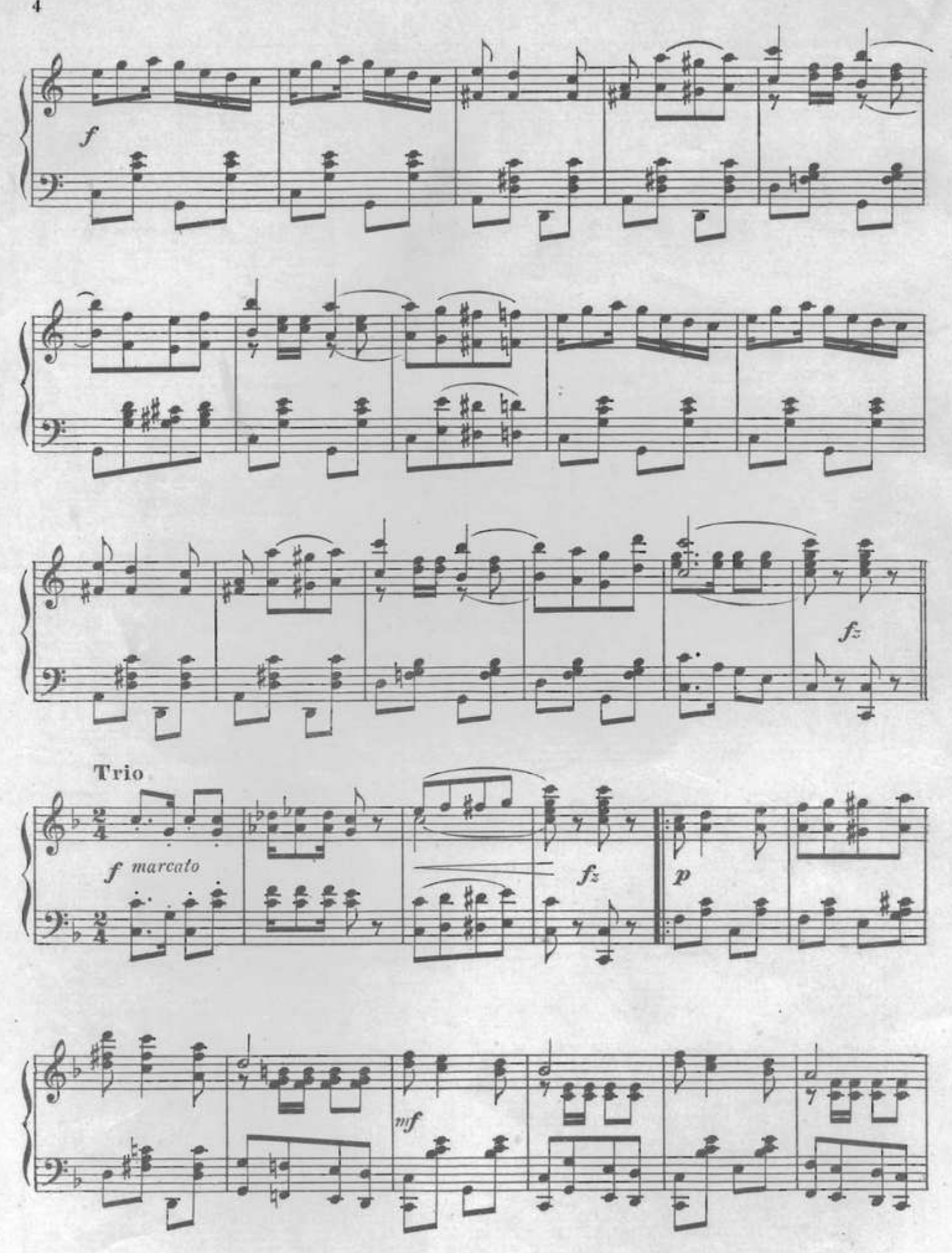
Sam's Laugh. 4