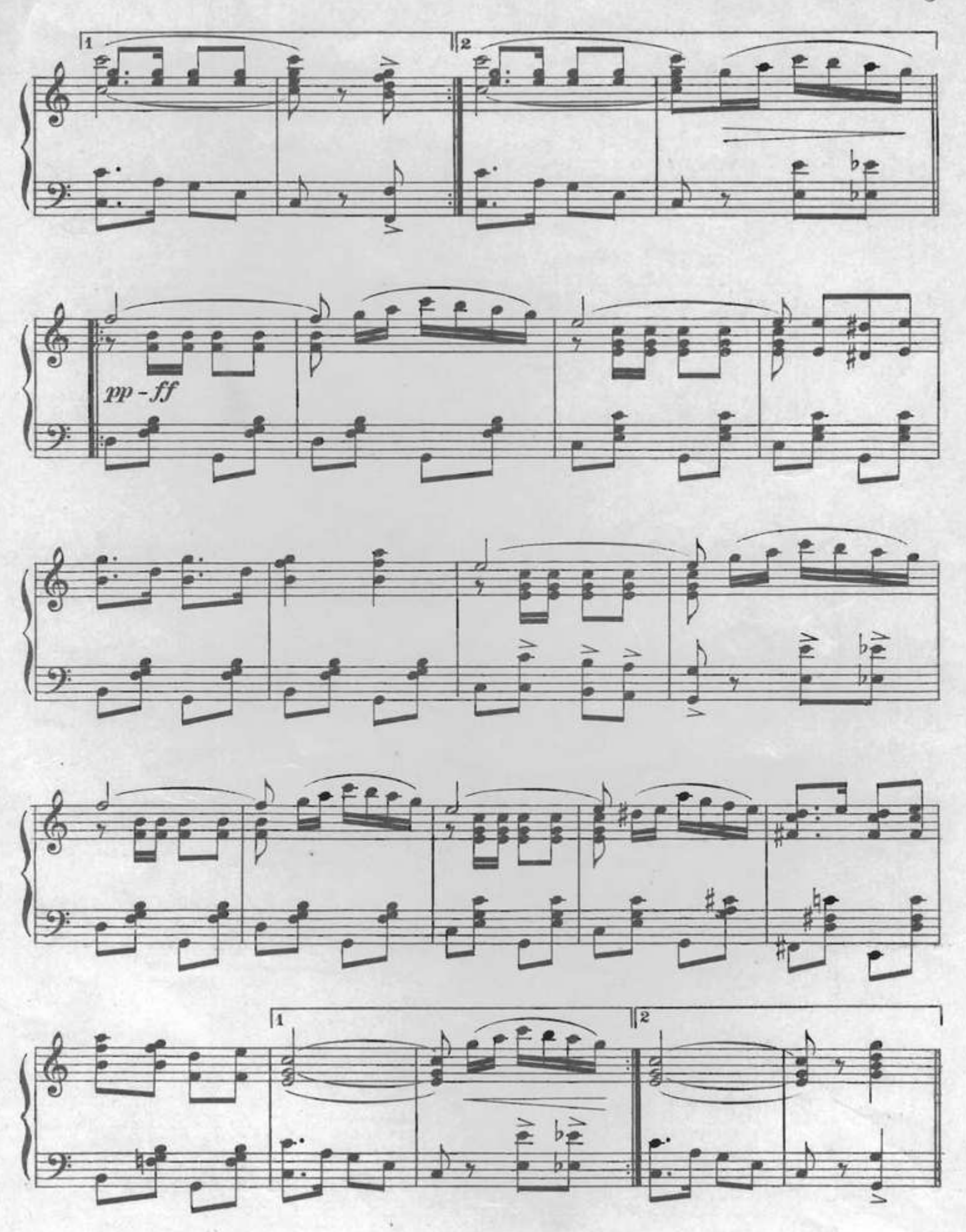
Sam's Laugh - 4.