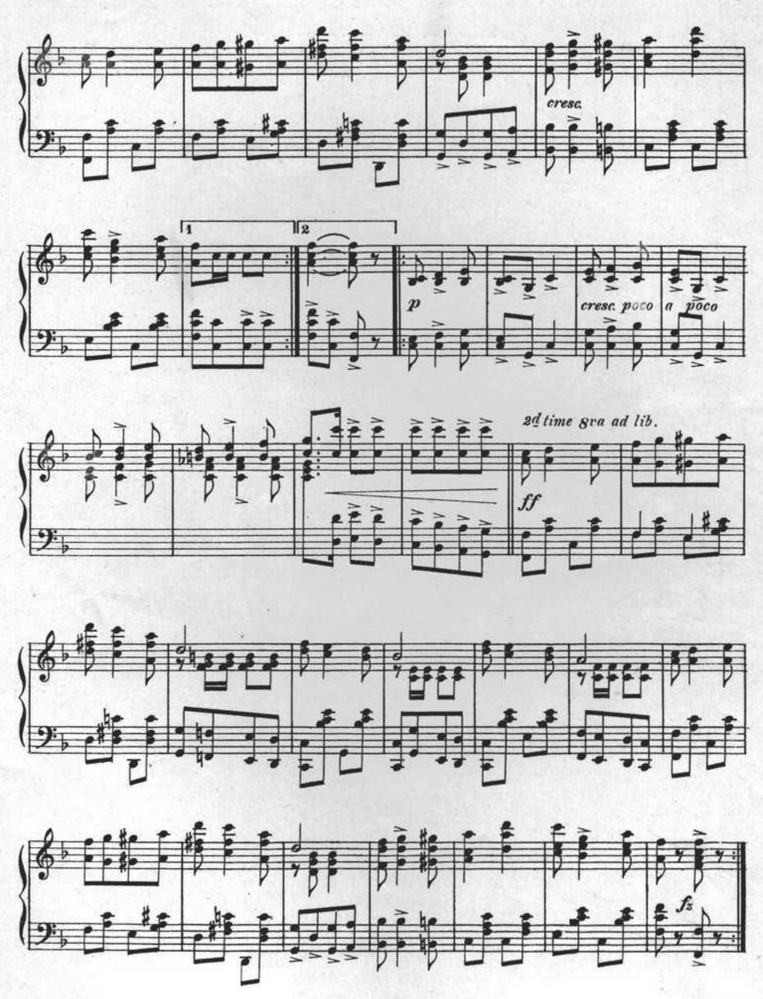
Sam's Laugh. 4