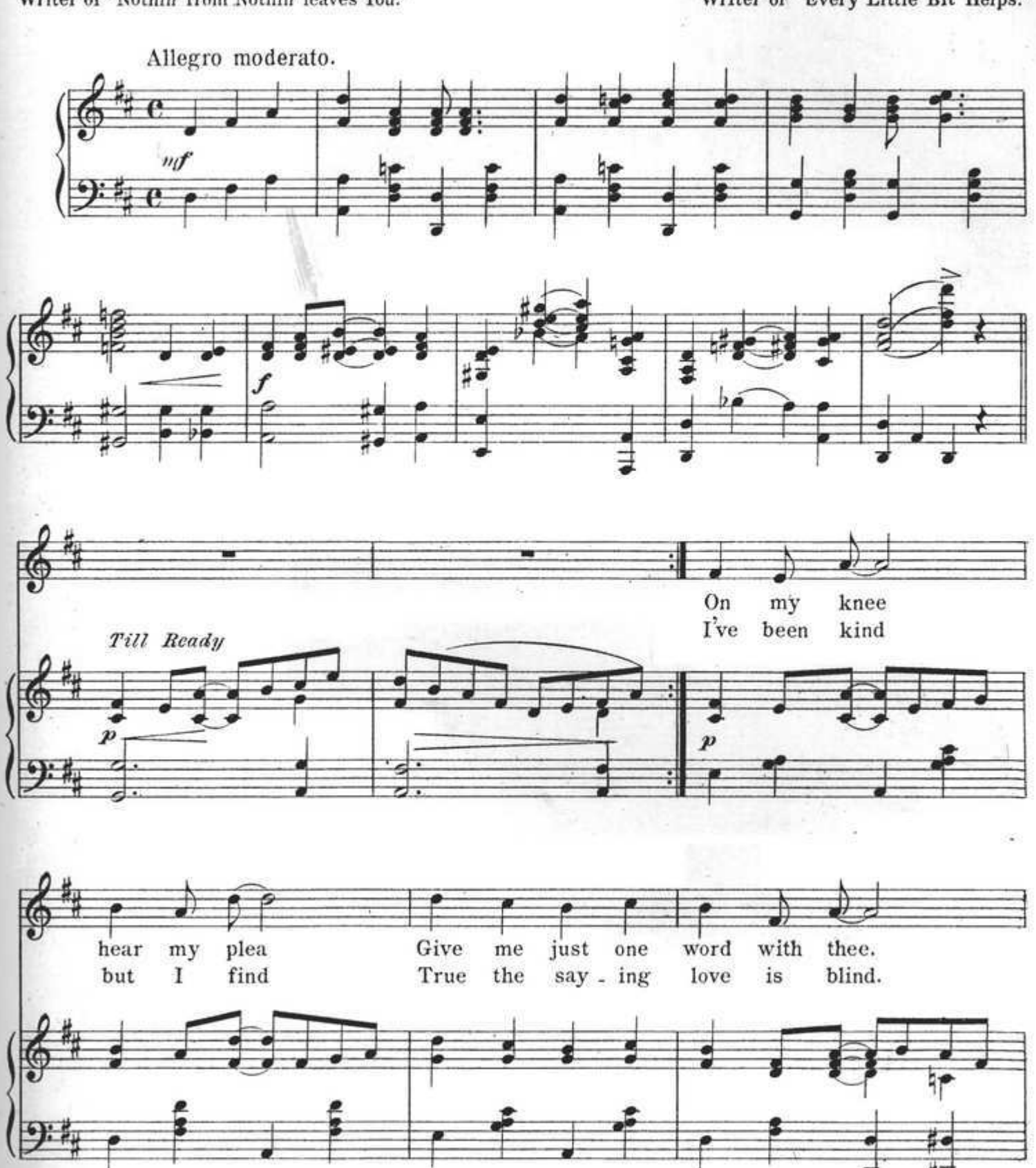
Copyright transferred 1906 to Helf & Hager Co.48 W.28th St.N.Y. Copyright 1906 by Fred Fischer Music Publ. Co English Copyright Secured.