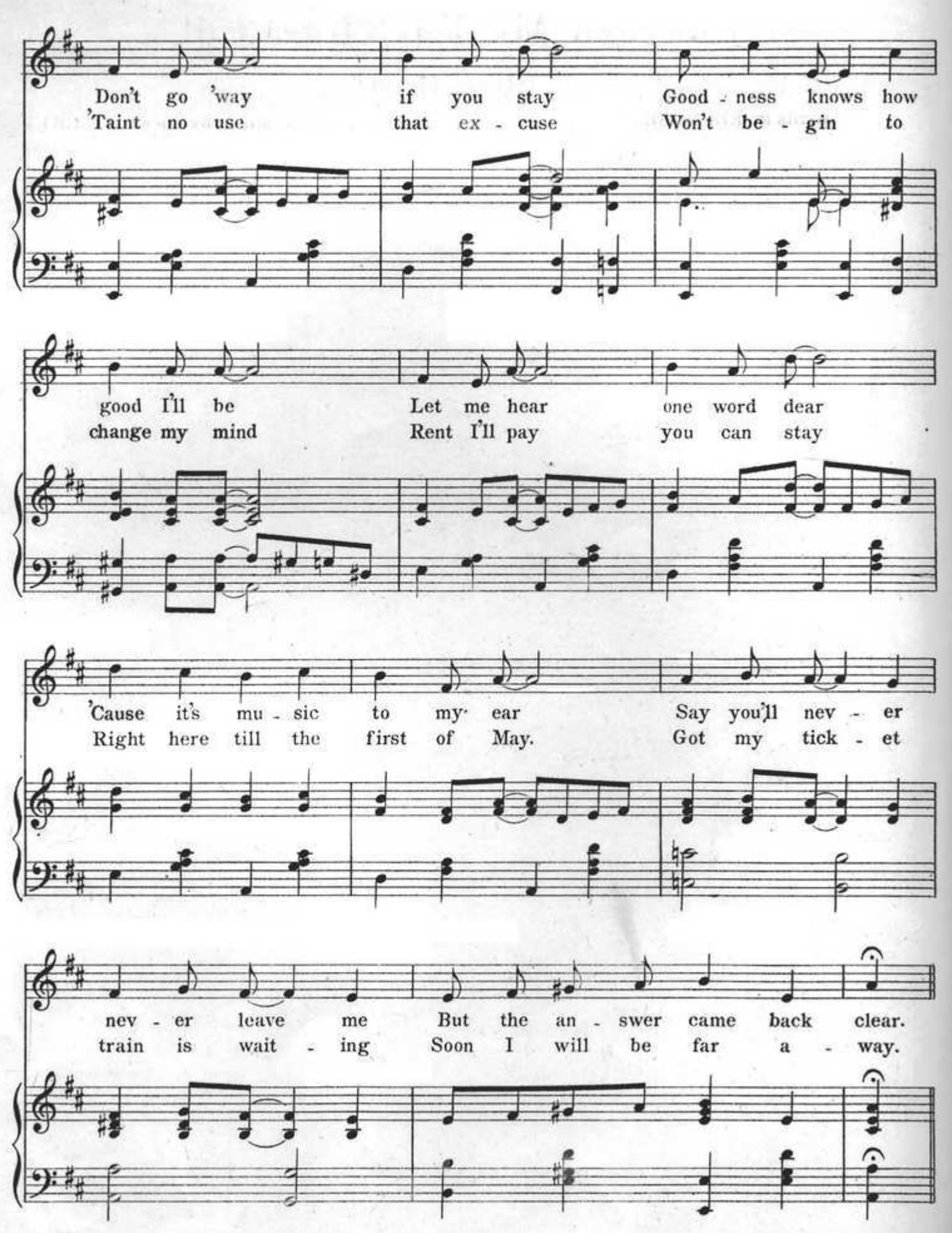
I've Said My Last Farewell.