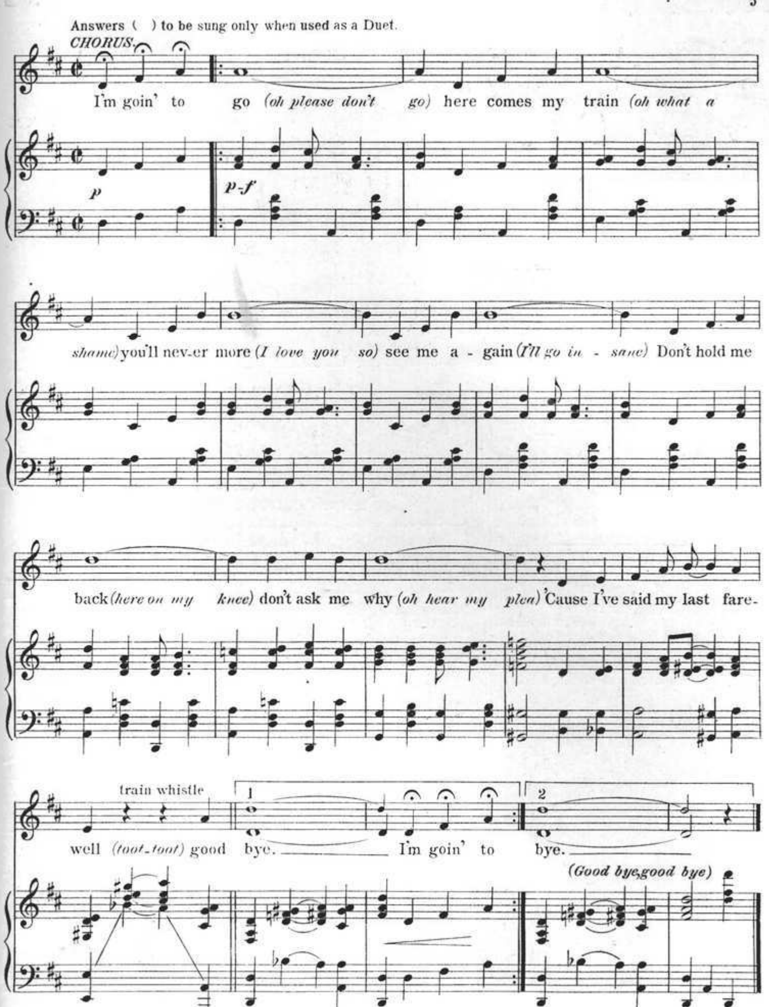
I've Said My Last Farewell.