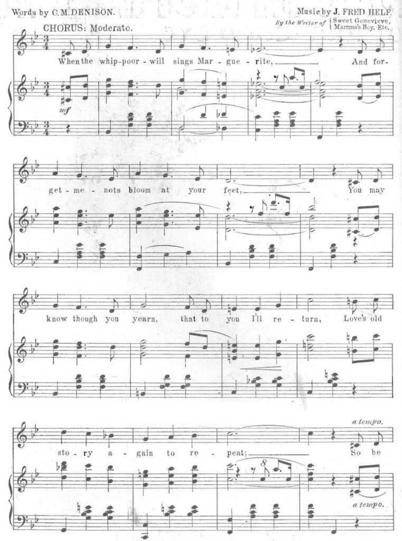
Copyright 1906, by Helf & Hager Co. 48 W. 28th St. N.Y. English Copyright Secured.

Complete copies may be had where you bought this.