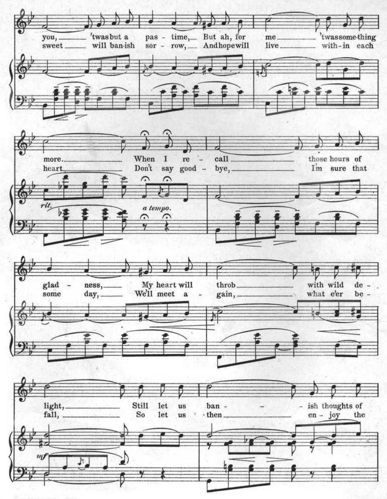
Just For To-Night. 4837-3