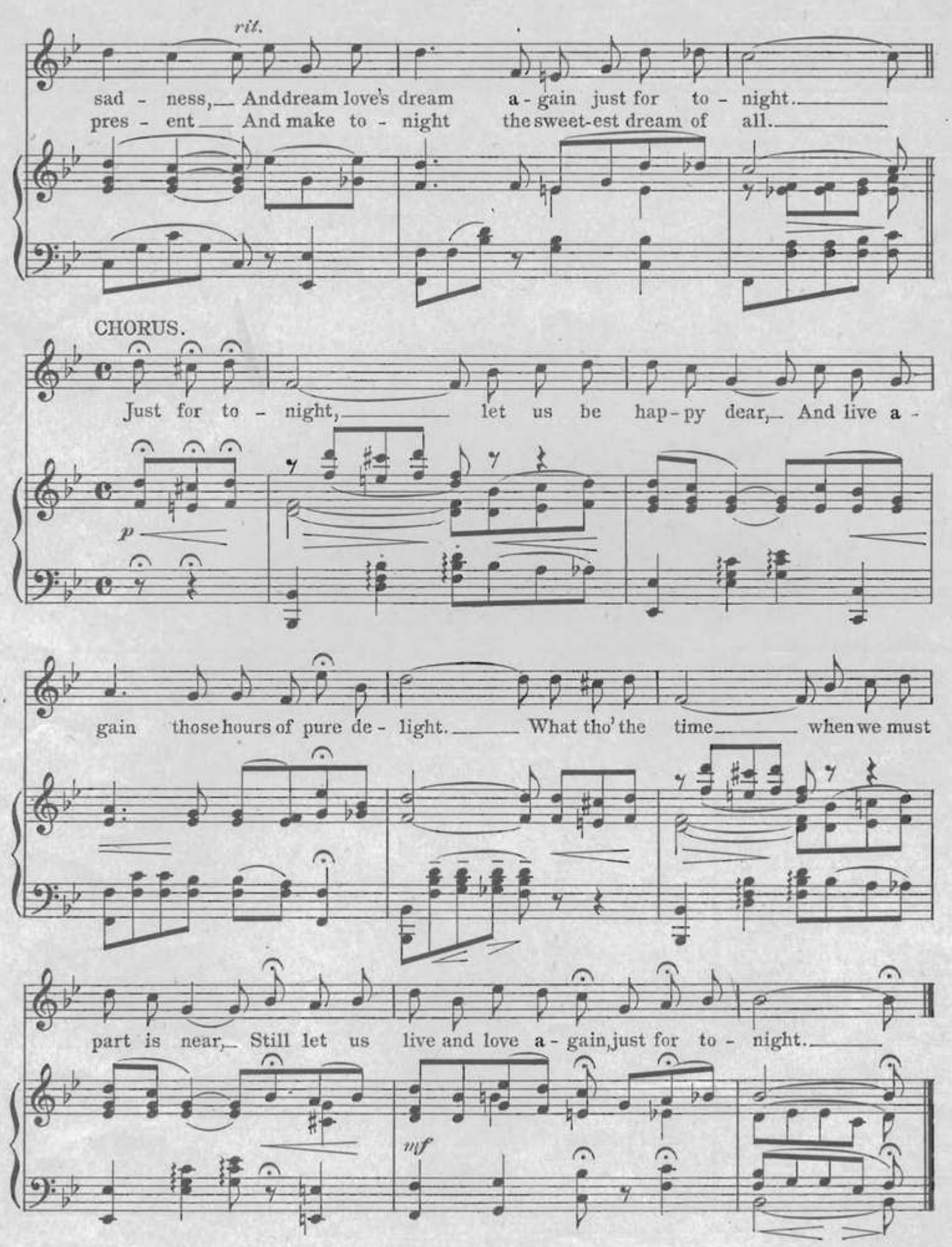
Just For To-Night. 4837-3