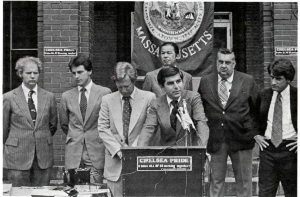
Michael Dukakis, as governor, visits Chelsea community leaders.

The critical role of states in a national urban policy must no longer be ignored or underestimated. State governments have both the money and the power to bring stability and