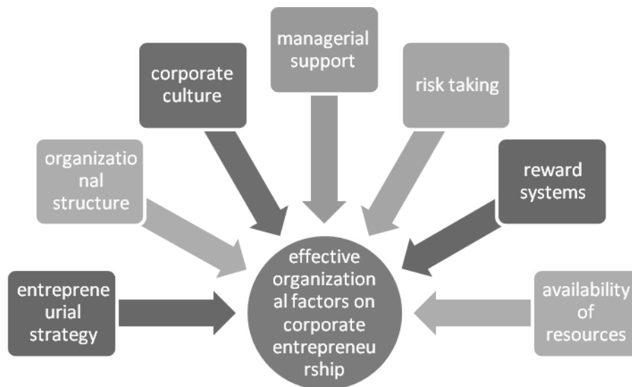
Figure 1: Theoretical framework

realm of the corporate entrepreneurship have shown that there are important individual, corporate, and environmental factors related to corporate entrepreneurial behavior (Covin & Slevin, 2011). As pointed as the classification of Covin and Slevin of the effective organizational factors covers the effective factors largely, this paper exploited this classification, which includes the seven factors of reward system, availability of resources, risk taking, managerial support, corporate culture, organizational structure, and entrepreneurial strategy. The theoretical framework of the effective organizational factors on corporate entrepreneurship according to the views of Covin & Slevin (2011) is presented in figure 1.