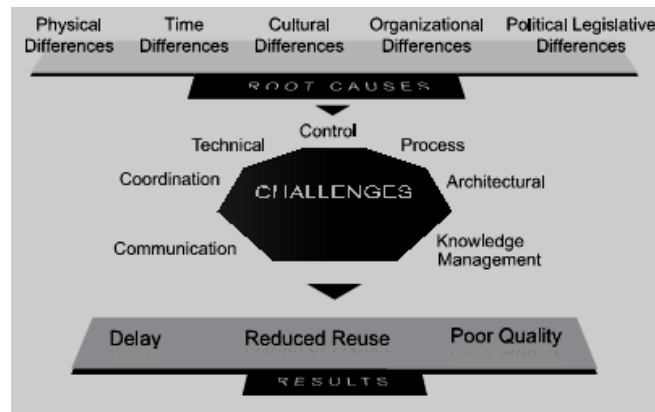
Fig. 3: Challenges of GSD together with Root Causes (Tufekci et al. , 2010)

The literature review conducted during the course of this study reveals that the most critical challenges of GSD are communication, coordination and trust. As shown in Fig. 3, we observe that the root causes of these challenges are related to cultural and time zone differences. Noll et al. (2010) identify eight barriers/challenges:- Language and Cultural Distance, Temporal Distance, Geographic Distance, Process and Management Issues, Fear and Trust, Infrastructure, Organization and Product Architecture. Jimenez et al. (2009) stress that Communication, Group Awareness, Software Configuration Management, Knowledge Management, Coordination, Collaboration, Project and Process Management, Process Support, Quality and Measurement, and Risk Management are they key challenges of GSD. Aranda et al. (2010) state that inadequate communication, time zone difference, cultural diversity and knowledge management are the key challenges to GSD.