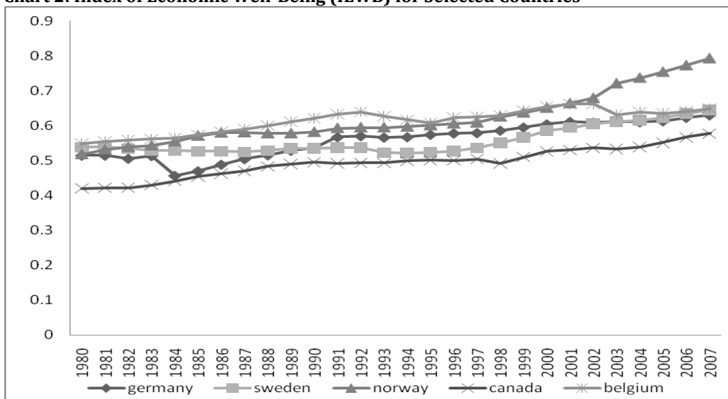
Chart 2: Index of Economic Well-Being (IEWB) for Selected Countries