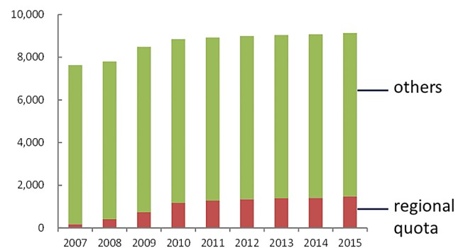
Figure 2 Number of entrants to Japanese medical schools (data from Ministry of Education, Culture, Sports, Science and Technology). 17

Aside from the quota, many prefectures have independent scholarship programmes for medical students. This scholarship is also given in exchange for postgraduate practice within the prefecture, usually including rural