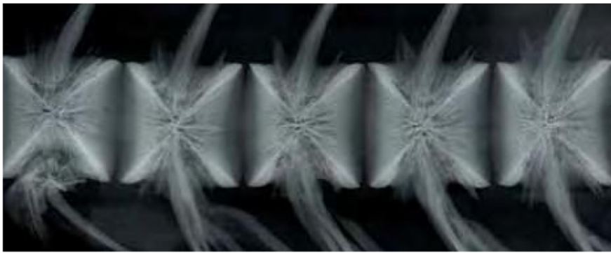
High-quality radiographs like this x-ray of a salmon vertebral column are the basis for early diagnosis of malformations.