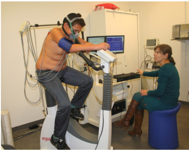
Figure 1 Bicycle Ergometer Exercise Test (stock photograph reproduced with permission from UZ Gent).

the statistical analyses, means of the echocardiographic parameters derived from three cardiac cycles were used.