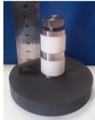
Figure 2. The prototype of the high voltage neutron generator with the carbon nanotubes ionizer which is under development.