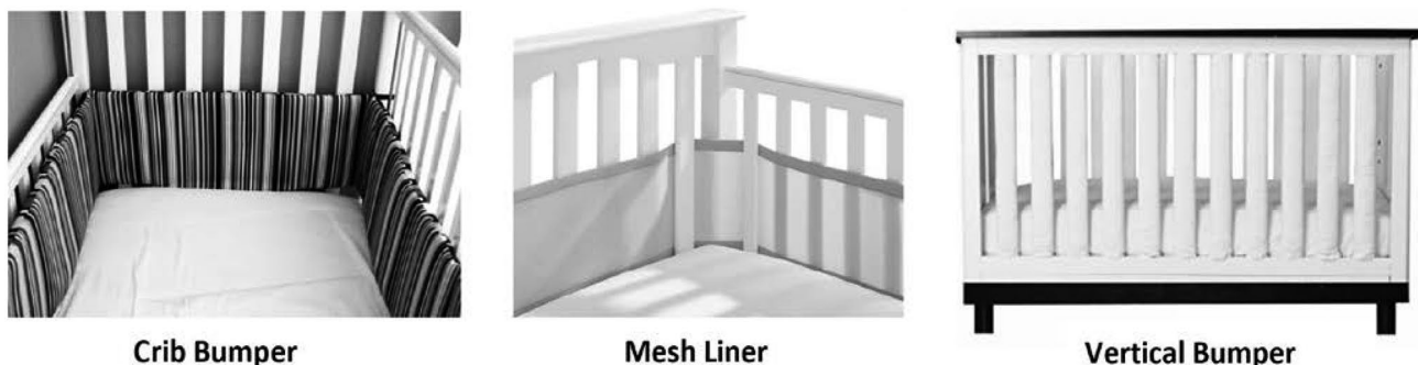
Fig. 1 Three types of crib barrier

Subscribers were offered an incentive to respond to our web survey's email link by entering a lottery for one of ten $100 Amazon gift cards. Five pilot tests with different email subject lines and instructions for 100 randomly selected P&N subscribers found no significant differences in response rates. After three follow-up emails, 12,332 emails were opened and 4070 (33%) were responded to (AAPOR 2016). Inclusion criteria resulted in 1344 eligible respondents who were mothers of singleton infants/toddlers, \leq 24 months old (Yeh et al. 2011), sleeping in cribs (Scheers et al. 2003) using a crib bumper (CB), mesh liner