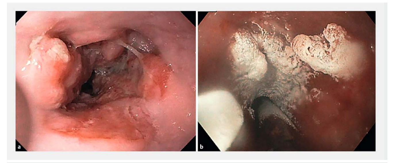
Fig.1 a Esophageal tumor causing luminal obstruction. b Spray cryotherapy is continued for 20 to 40 seconds after a bed of frost has formed.

drugs unless the cardiopulmonary risk of discontinuing these agents was deemed unacceptable.