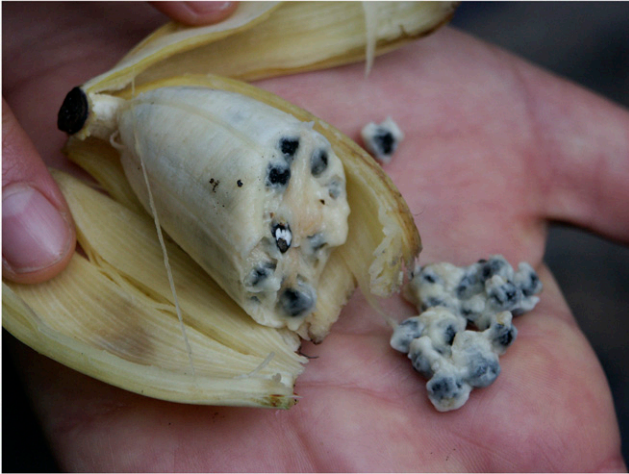
FIGURE 4. Wild banana plant Musa balbisiana native to Southeast Asia depicting large seeds capable of causing intestinal obstruction through formation of phytobezoar. This figure appears in color at www.ajtmh.org.