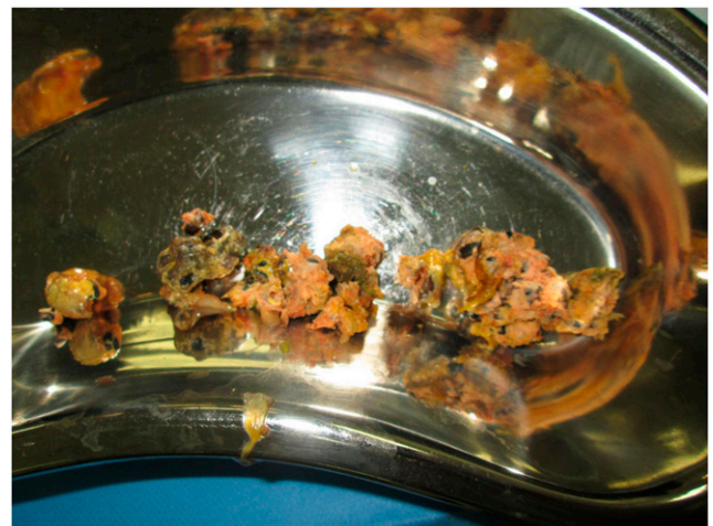
FIGURE 3. Phytobezoar specimens extracted from the bowel. This figure appears in color at www.ajtmh.org .