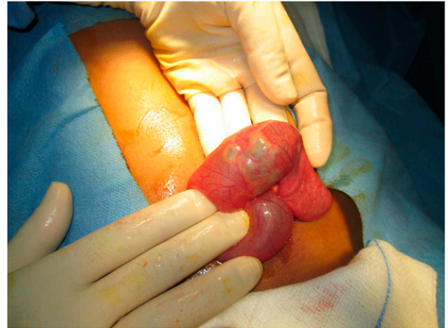
FIGURE 2. Intraoperative finding of bezoar causing bowel obstruction. Individual banana seeds are visible through the intestinal lumen. This figure appears in color at www.ajtmh.org .

The offending fruit, Musa balbisiana , is a wild banana species native to Southeast Asia, spanning from India to Papua New Guinea (Figure 4). Ingestion of the fruit seeds is known to cause intestinal complications, including constipation, appendicitis, and small bowel obstruction, most commonly in rural, impoverished populations because of limited access to safe nutrition. 1–4 Despite local wisdom to avoid these dangerous fruits and multiple reports of wild