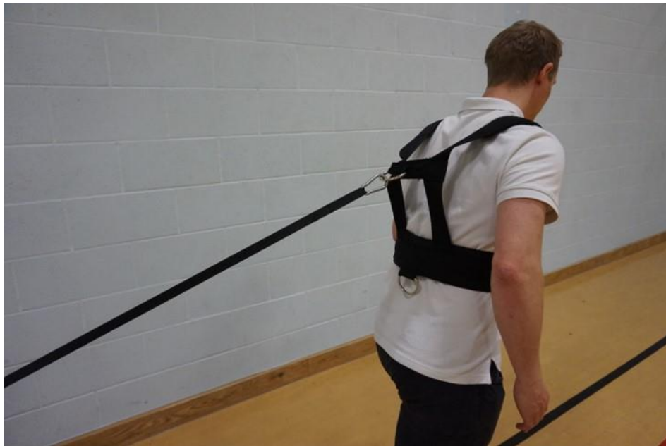
Figure 1. Run Rocket™ harness attachment.

Participants placed their front foot 5 cm behind the first set of gates and used the same front foot for each trial. A two-point standing position was used at the start and participants started their sprints on their own volition. A shoulder harness supplied by the manufacturer was worn by the participants and attached to the Run Rocket™. The cord of the Run Rocket™ was attached approximately midway between the medial borders of the scapulae by way of a D-ring and a waist buckle was used to secure the harness (Figure 1). The resistance of the Run Rocket™ was adjusted using the manual adjuster knob; this was conducted blind to the participant and lead researcher. Full recovery took place between sprints (>6 min). All testing took place on an indoor basketball court.