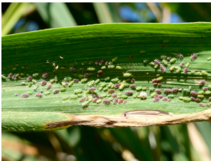
Figure 6. Aphids feeding on Phragmites australis in a constructed wetland.