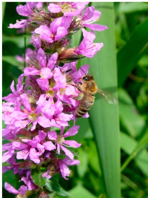
Figure 5. Marsh plants such as Lythrum salicaria provide food resources for insects.