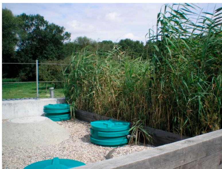
Figure 3. Constructed wetlands usually consist of planted basins where water purification takes place and technical elements such as those seen in the foreground of this photo.

Constructed wetlands (Figure 3) have been successfully applied in a range of countries, especially in the decentralized sector for the treatment of different types of polluted wastewater (municipal or industrial wastewater, contaminated river water). Their success has mainly been assessed in terms of water purification performance. Moreover, constructed wetlands can contribute to maintaining or improving biodiversity, especially in urban areas [120]. However, this aspect has received little attention so far. Assessments of the biodiversity of constructed wetlands have mainly been performed in comparison to natural wetlands or, less frequently, to other constructed wetlands [121]. In urban areas, however, constructed wetlands usually do not replace natural wetlands, instead, they are located on previously disused sites or on sites renatured after the demolition of buildings. To our knowledge, comparative studies of the biodiversity of constructed wetlands vs. disused or renatured urban sites do not exist yet.