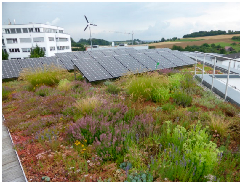
Figure 2. Combinations of vegetation and solar panels on green roofs, such as on this roof by ZinCo, Germany, can increase habitat heterogeneity. (Photo: A. Z.).