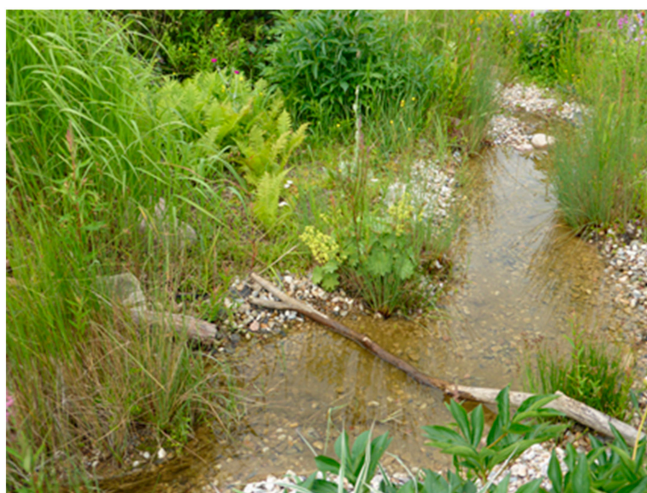
Figure 9. This wetland, which has been integrated into a green roof, supports the presence of plants and animals usually absent from green roofs. (Photo: A. Z.).

Supplementary Materials: The following are available online at http://www.mdpi.com/2071-1050/11/20/5846/s1 , Table S1a: Overview of all 77 articles that were included in the review of the effects of green roofs on biodiversity in urban areas; Table S1b: Overview of articles that were excluded from the review on effects of green roofs on biodiversity in urban areas due to one or several of the following reasons: no focus on green roofs, no focus on effects of green roofs on biodiversity, conceptual article, no access to the article (online or through a direct request to the author). The following are available online at http://www.mdpi.com/2071-1050/11/20/5846/s2 , Table S2a: Overview of all 65 articles that were included in the review of the effects of constructed wetlands on biodiversity in urban areas; Table S2b: Overview of articles that were excluded from the review on effects of constructed wetlands on biodiversity in urban areas due to one or several of the following reasons: no focus on constructed wetlands, no focus on effects of constructed wetlands on biodiversity, conceptual article, no access to the article (online or through a direct request to the author), focus on microorganisms.