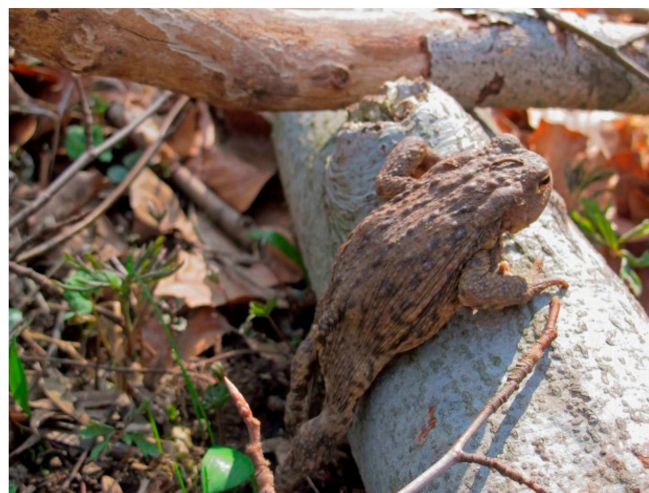
Figure 8. Amphibians can pass natural structures in the surroundings of constructed wetlands much better than surfaces made of concrete or plastic sheets.