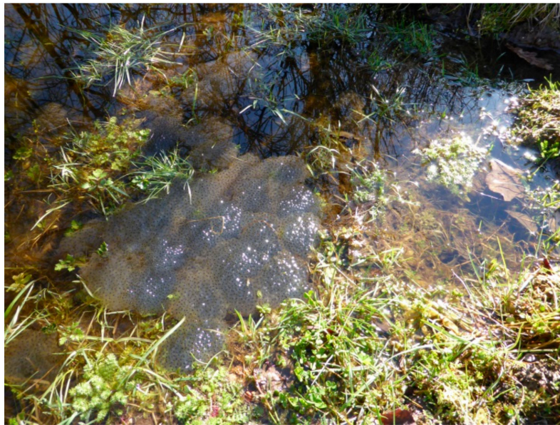
Figure 4. Shallow zones of water within constructed wetlands support spawning amphibians.

surroundings. Integrated constructed wetlands for the treatment of agricultural wastewater in Ireland that consist of a number of connected ponds serve as habitat for a range of organisms, including macroinvertebrates [139]: A total of 134 taxa have been recorded, the most frequent of which were Coleoptera (66 taxa, 49%), Hemiptera (20 taxa, 15%), Diptera (11 taxa, 8%), Gastropoda (11 taxa, 8%), Trichoptera (9 taxa, 7%), and Hirudinea (5 taxa, 4%). Clean ponds (i.e., those last in line) supported a particularly high diversity of macroinvertebrates [139]. Therefore, Becerra-Jurado [140] suggested that the number of ponds should be increased to a minimum of five and that the expanse of water should be increased as well. Holtmann et al. [141] showed that rainwater ponds in urban areas play an important role in the preservation of dragonflies and for endangered species in particular. Regular maintenance and thus high habitat quality of these ponds compensated for the low quality of the surrounding urban landscape (Figure 5).