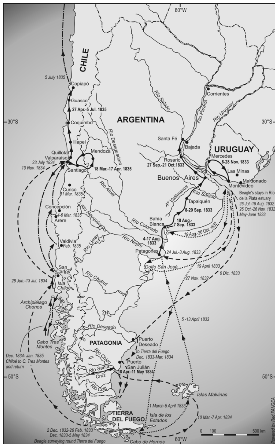
Figure 1: Journeys of HMS Beagle in southern South America (base map modified from Bowly 1990). Dates of Darwin's rides overland are shown in bold while the trips on board HMS Beagle are shown in italics, taken from Keynes (2001).

The third and more important fieldtrip was, after landing in Carmen de Patagones in August 1833 (Fig. 1), to ride across the Pampas to Buenos Aires city