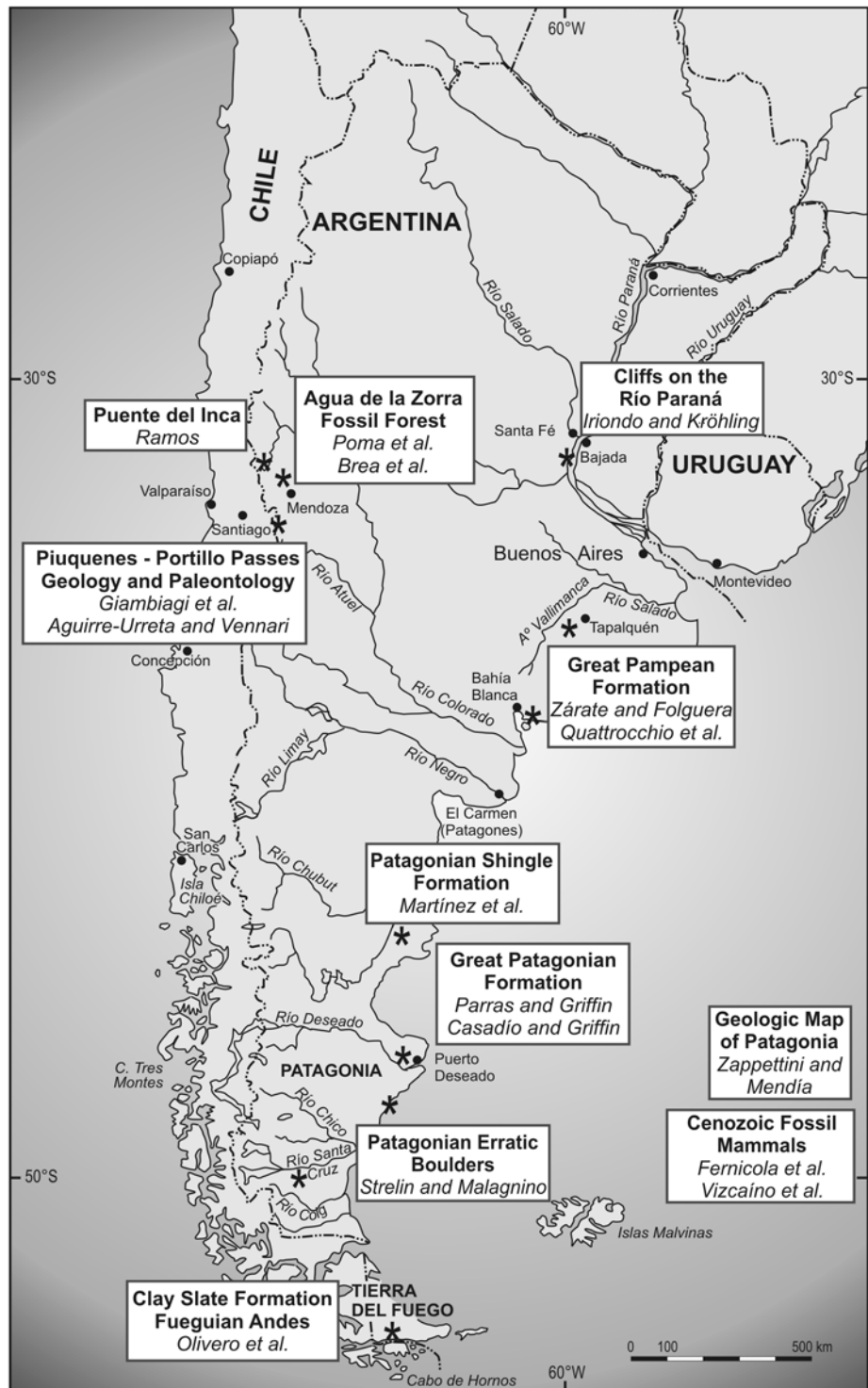
Figure 2: Approximate location of the different contributions dealing with Darwin's geological research in Argentina indicated by an asterisk (compare with Figure 1).

terial. Based on their observations, they answer Darwin's queries about the process that buried the forest in standing position. It should be noted that these