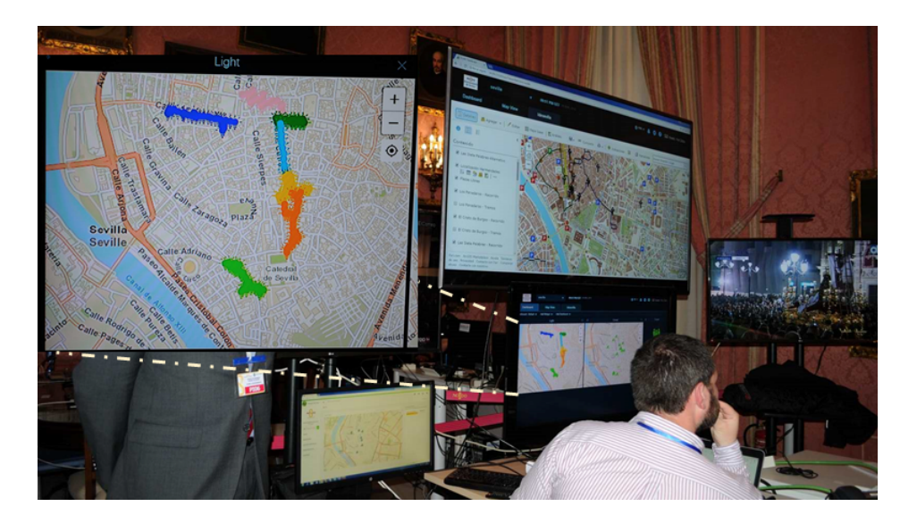
Fig. 2. Command Post of the safety solution in the Seville council for the Holy week.