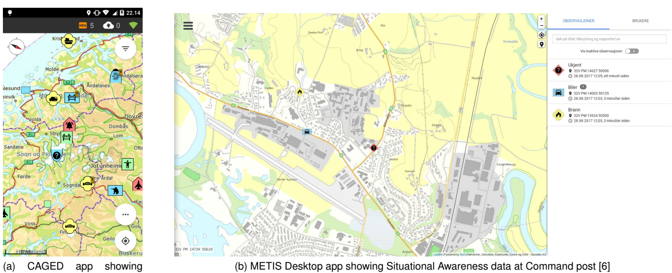
(a) CAGED app showing shared Situational Awareness data [6]