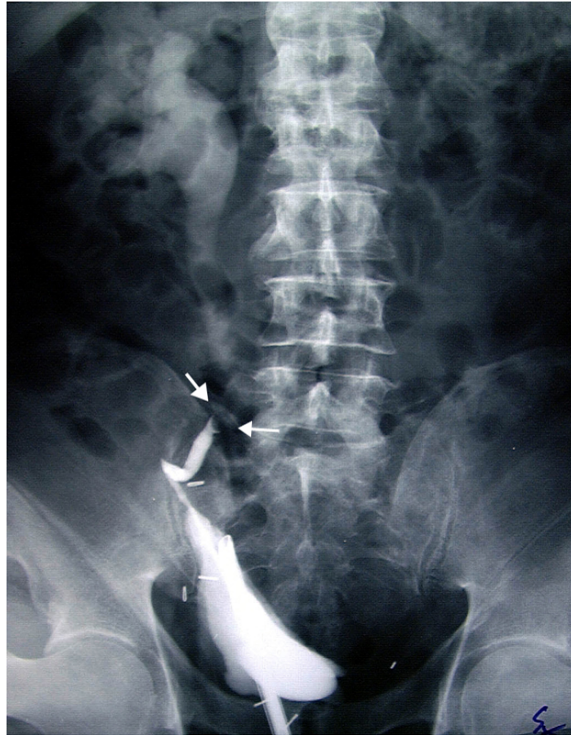
FIGURE 1. Ascending ureteropielography highlighting a ureteral filling defect (note the delayed clearance of contrast medium of the previous urography).

During a second operation, after a wide segmentary ureterectomy with a disease-free proximal ureteral margin, the availability of a 10-cm long appendix with a normal macroscopic aspect made us decide to use it. After opening the appendix tip, its patency was checked by means of a 12-Ch catheter. With the help of a ureteral tutor MJ 8 Ch, the appendix was interposed between the ureter and the bladder antiperistaltically, so as to preserve its physiological orientation (base at the top and tail at the bottom) and to avoid the risk of rotation on the appendicular meso (Fig. 2). Ureteroappendicular anastomosis was performed by spatulating the ureter stump, while ureterovesical anastomosis was performed directly extravesically.