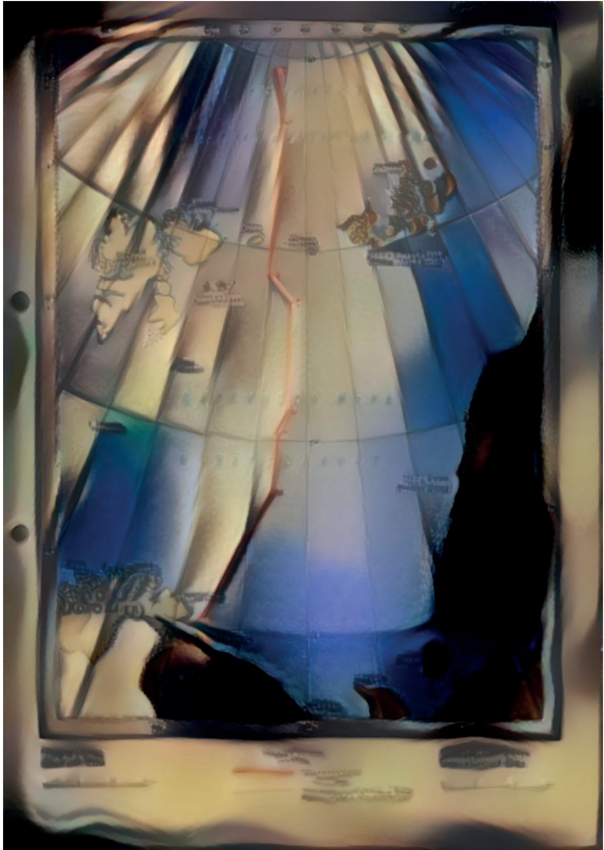
Map (UNTS: I-49095, volume 2791) annexed to the 2010 Treaty between the Russian Federation and the Kingdom of Norway concerning Maritime Delimitation and Cooperation in the Barents Sea and the Arctic Ocean.