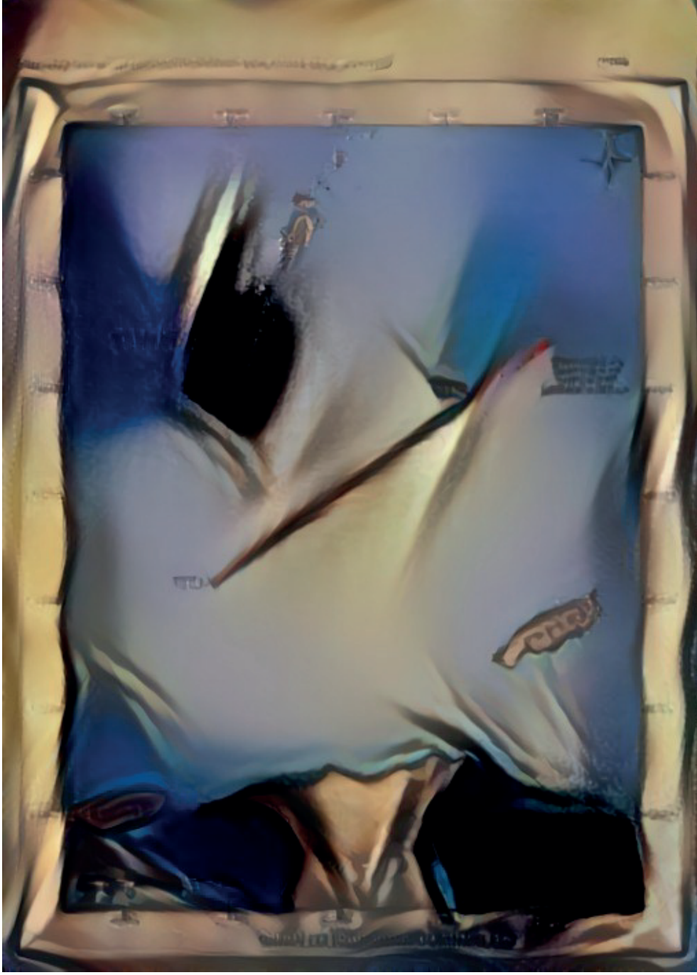
Map (UNTS: I-47548, volume 2675) annexed to the 2010 Treaty between the Republic of Trinidad and Tobago and Grenada on the Delimitation of Marine and Submarine Areas.