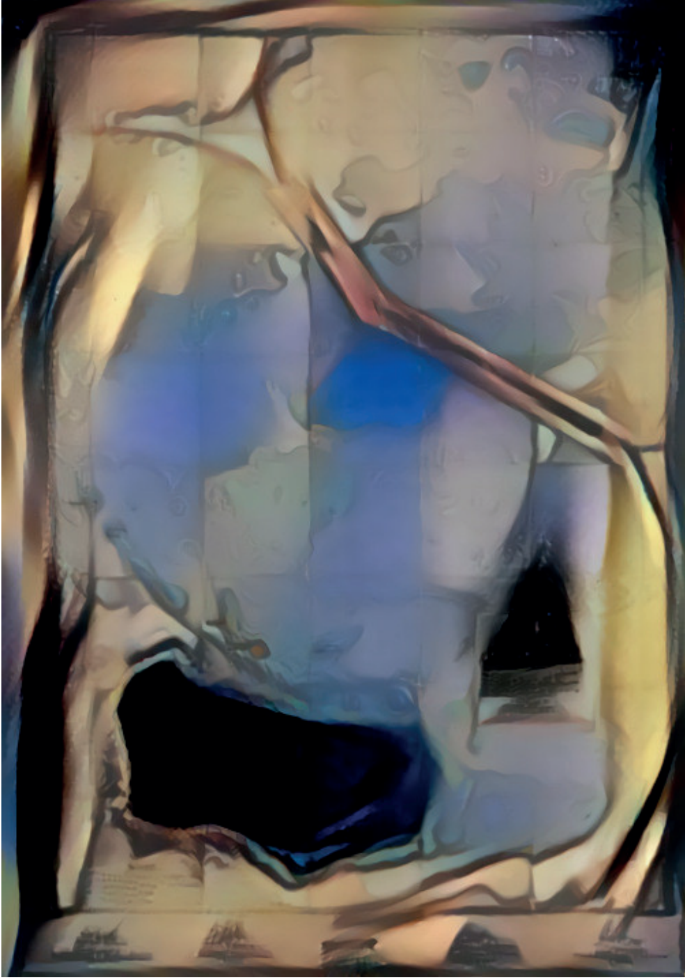
Map (UNTS: I-54729) annexed to the 2014 Agreement on Maritime Delimitation between the Republic of Ecuador and the Republic of Costa Rica.