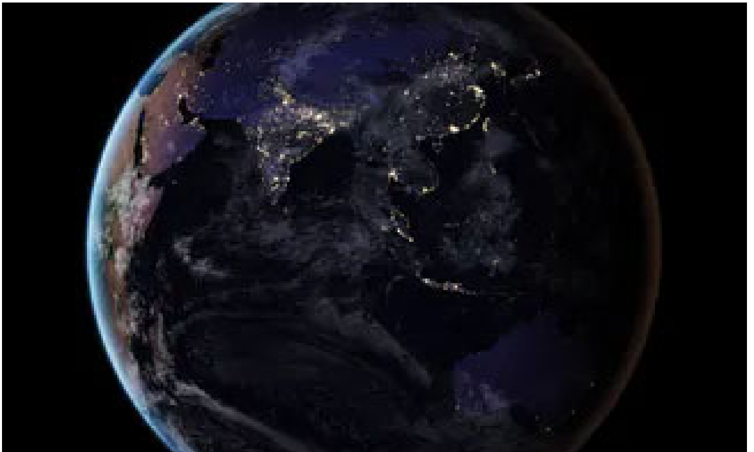
As Earth's population heads to 10 billion, does anything Australians do on climate change matter?