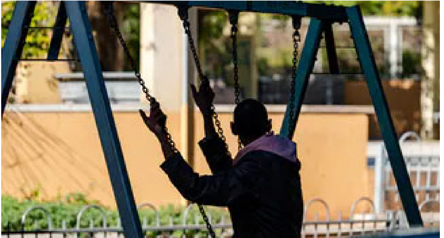
Migrants and the bond with God: attachment and survival are linked