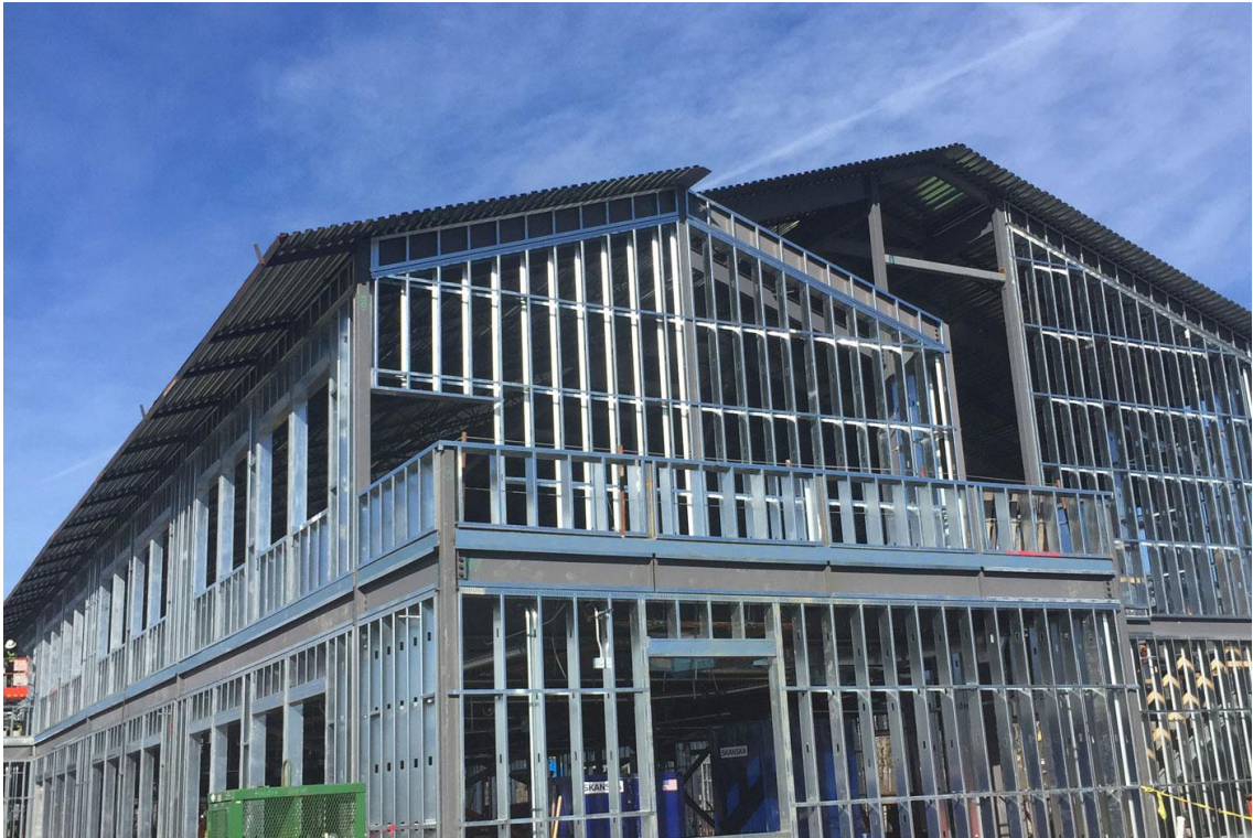
Figure 1.1 Building made up from the cold-formed steel