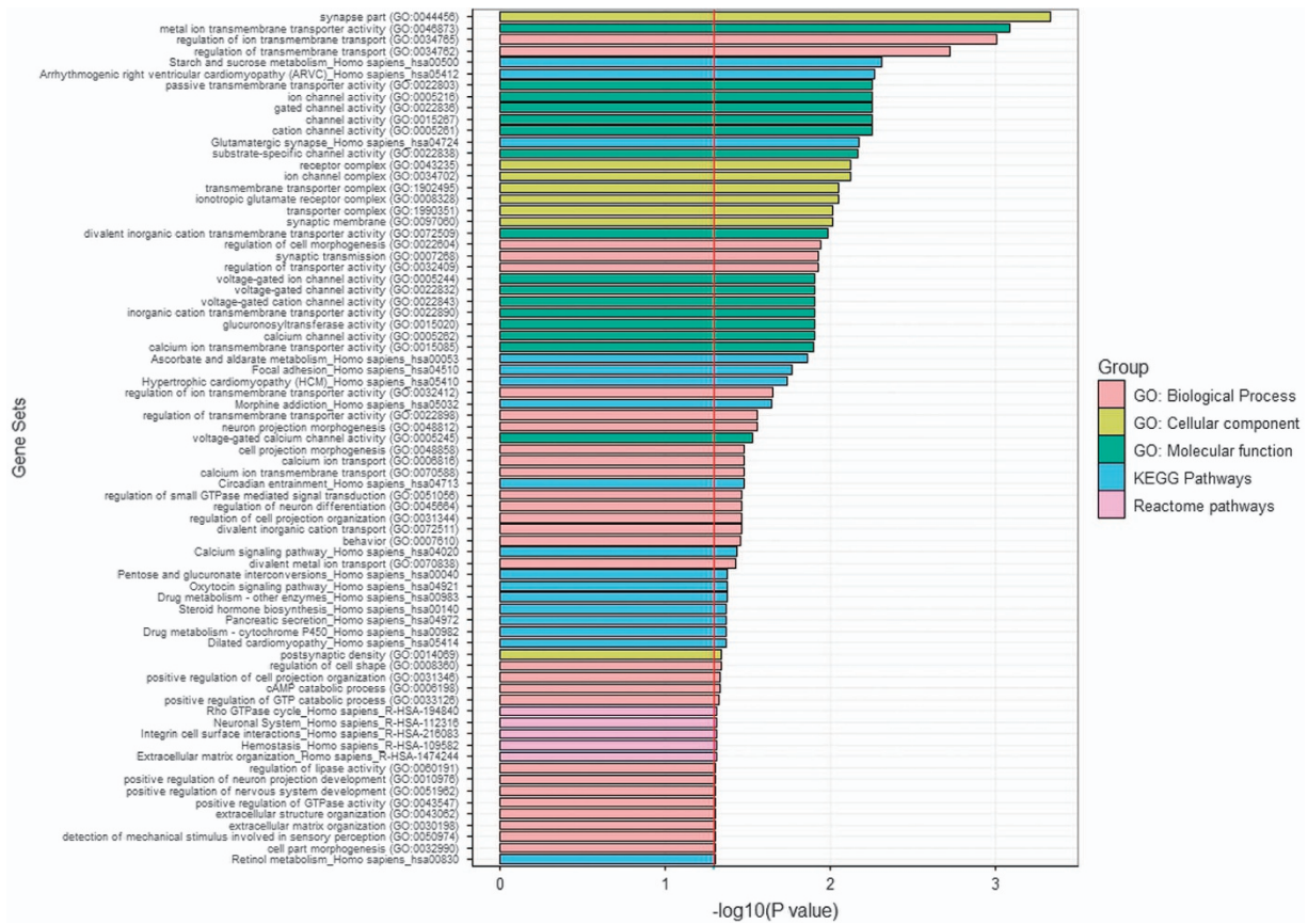
Figure 2. Results of the formal enrichment analyses summarizing the Gene Ontology (GO) terms and Kyoto Encyclopedia of Genes and Genomes (KEGG) or Reactome pathways enriched in this study with a Bonferroni-corrected adjusted P -value < 0.05 . Red line: nominal significance threshold (0.05) of corrected P -values.

been shown to be enlarged after aerobic exercise (voluntary running) in stereological histology and MRI-based animal studies. 27,72