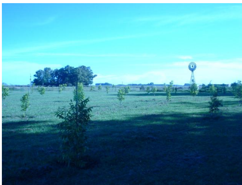
Figure 1. The Pecan nut ( Carya illinoensis ) cultivation site.

The experiment was developed in Villanueva, General Paz, Buenos Aires (S Latitude 35° 45' and Longitude W 58° 26'), on a soil classified as Thapto-argic Hapludoll (Soil Survey Staff, 1999). The test was performed on a staggered distribution with 8m x 8m planting distance, (Figure 1) with a randomized block design with four replications to compare the liquid fertilizer treatments (15 cm 3 / 2 litres of water per hole), compost (5 litres / hole), vermicompost (5 litres / hole) and control without fertilization, in three applications dates: 11/12/09, 03/14/2010, and 19/09/2010.