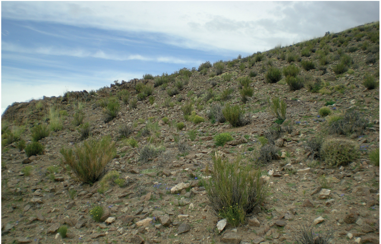
Figure 2. General view of type locality of Gutierrezia tortosae .