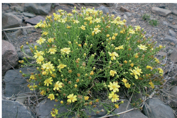
Figure 3. Gutierrezia tortosae , habit.

Cochinoca, Humahuaca, Rinconada, Susques, Tilcara, Tumbaya, Valle Grande y Yavi, and in the province of Salta, departments of Iruya, La Poma, Los Andes, Rosario de Lerma and San Antonio de Los Cobres. This species grows on rocky slopes, at elevations ranged from 2000 to 4400 m and it is associated with xerophytic shrubs of the genera Fabiana , Baccharis , Junellia , and Senecio , and cacti of the genera Trichocereus , Opuntia , Parodia , and Lobivia (Figs. 2 and 3).