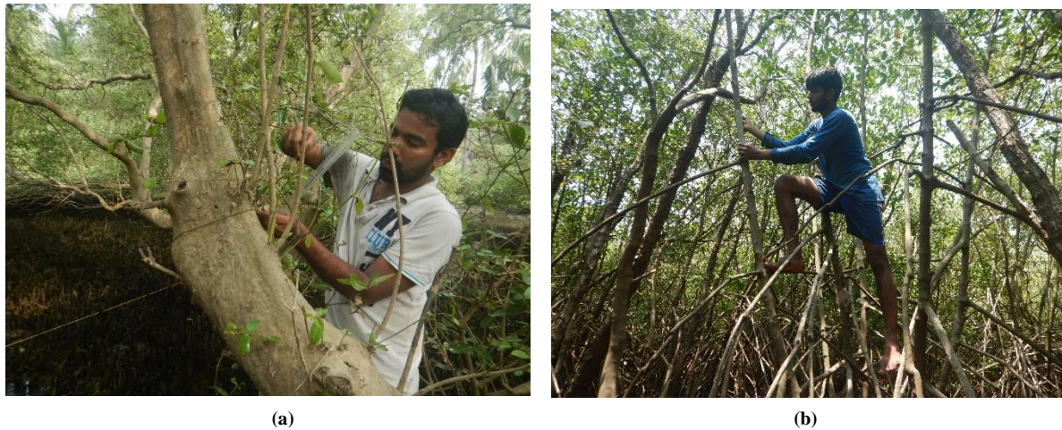
Figure 2. Measurement of DBH of (a) Avicennia marina and (b) Rhizophora mucronata .

were considered for the measurement of DBH (Figure 2). In Rhizophora mucronata , the trunk diameter at 30 cm above the highest prop root was measured (Komiya, Pongpan, and Kato, 2005).