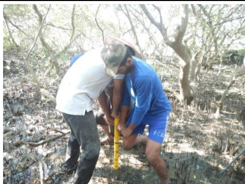
Figure 3. Sediment sampling using a PVC core.