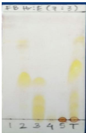
Figure 1: Chromatogram merging the fraction VLC result

fewer stains. Separation by liquid vacuum column chromatography continued until a simpler subfraction was obtained, then purified using radial chromatography to obtain a single stain.