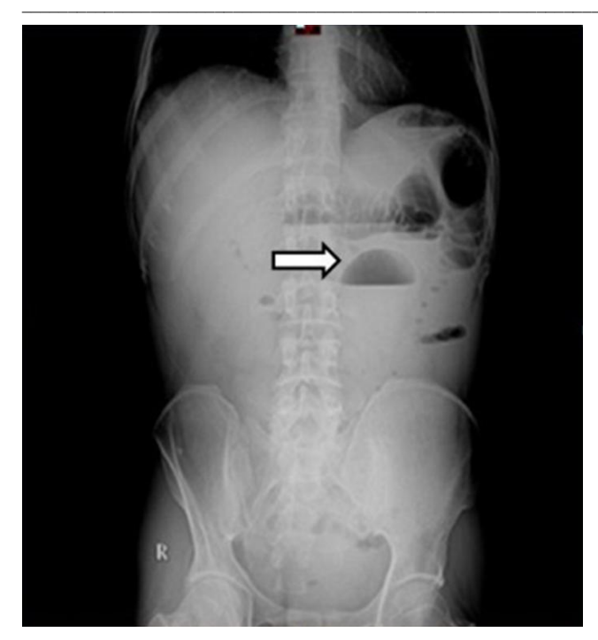
Figure 1: Abdominal X-ray findings. Air fluid levels in small bowel (arrow)

Air fluid levels were showed in small bowel at quadrant the upper and ruled pneumoperitoneum on abdominal X-ray (Fig. 1). Ultrasound revealed SBO with dilated bowel loop, decreased bowel peristalsis and homogenous free fluid mainly located in pouch of Douglas. On CT, SBO signs were also detected. The most distended loop (52 mm in diameter) proximal to transition point (Fig. 2A) and the thickened small bowel loops (Fig. 2B) were found at the left upper quadrant. Moreover, the whirlpool sign indicated mesenteric volvulus was showed at this area (Fig. 2C). No free gas, and no hernia was found. Blood count revealed that white blood cell count was 18.2 g/l, and percentage of neutrophil was 87.7%.