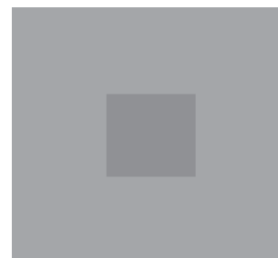
Figure 1 Layout of one primary and one secondary stimuli for the evaluation of the effect (primary stimuli of 50% RTV, secondary stimuli of 40% RTV)

of adjacent zones on the coloration of the evaluated stimuli. In the above described manner of the form design of 24 existing zones on offset machine that has max. format of 51 \times 72 cm, each second zone is blank, and vertical lines are multiplied up until the end of sheet (Fig. 2).