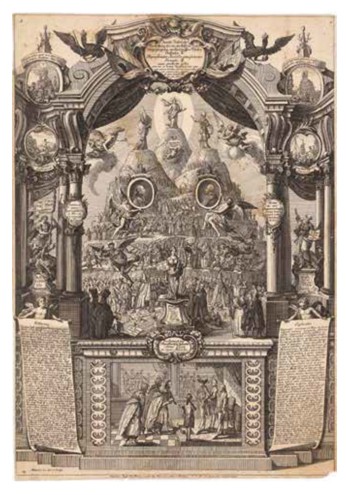
5. Almanac print, 1784, Vienna Museum, inv. no. 91507 Grafika u Almanahu za 1784. godinu

a central mountain or hill (with thorny bushes, surmounted by the highlighted players of the two scenes [e.g. St Peter, Joseph and the freemason]), and to both main scenes which are packed with people. Similarly, both cases feature a particularly striking passage from the Bible, the interpretation of which had been the task of the (Catholic) clergy for centuries, but which is now subjected to a radical new explanation. In both cases, Emperor Joseph II is the undisputed protagonist who ostensibly carries out this reinterpretation: We notice a significant depreciation in the value of the hitherto leading role of the clergy. In these two cases, graphically contrastive images are clearly presented with the intention of confronting the light of the Enlightenment with the dull, and as the depictions here suggest, idle mass of clergy. Yet neither picture expresses a new iconography. Instead, the Enlightenment theme implants itself, as it were, in prominent traditions; it undermines them and redefines their content. Even so, the prints should not be understood solely as comments on a particular direction in church policy. Rather, the iconography of the monarch is redefined through the new role which the ruler assumes as a proactive instigator of church policy.