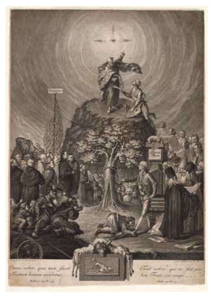
1. Allegory of Joseph II's ecclesiastical policy, 1783, Austrian National Library, Vienna, PORT_00047904_01 Alegorija crkvene politike Josipa II.