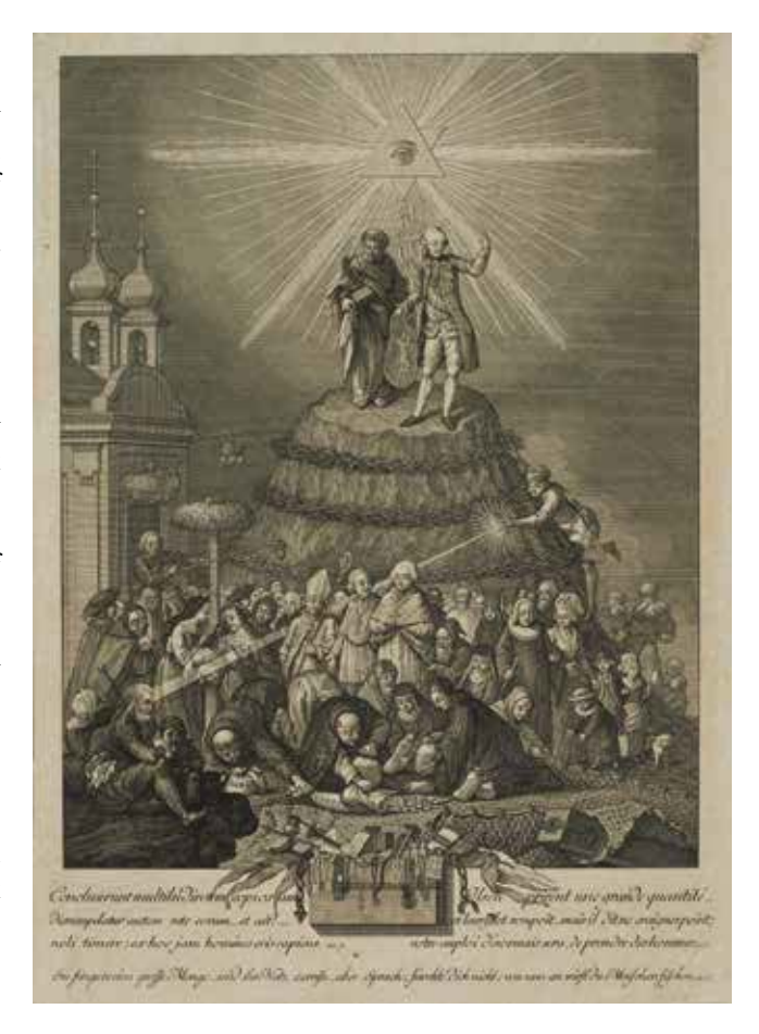
3. Allegory of Joseph II's ecclesiastical policy ( Miraculous Catch of Fish ), 1783, Vienna Museum, Vienna, inv. no. 31726 Alegorija crkvene politike Josipa II. (Čudotvorni ribolov), 1783.

Consequently, the emphatic attitude struck in the main scene (with Joseph II) comes with a cautionary undertone that cannot be gained from the picture itself, but is derived from religious discussions which were taking place at the time. At the same time, the text banner in the print formulates an interesting combination of text and image, because the passages in German and French on the sides (after Matthew