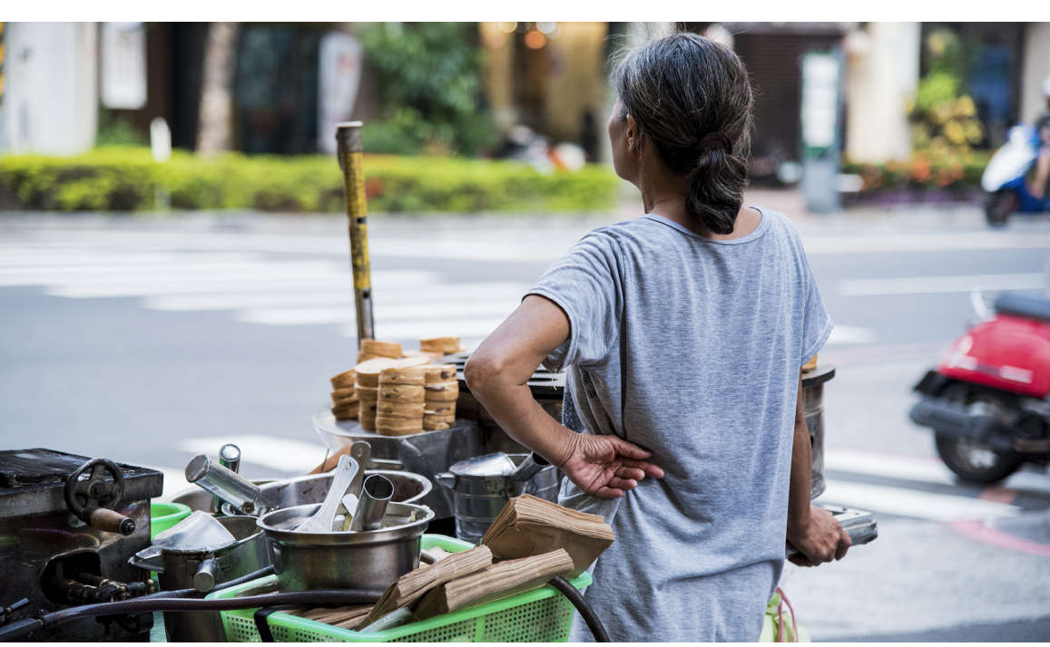
Cover photo: A street vendor waiting to sell her ready-to-eat food.

Between 2016 and 2019, a research team led by Cardiff University collaborated with partners on the ESRC-DFID-funded project 'Economic Recovery in Post-Conflict Cities: The Role of the Urban Informal