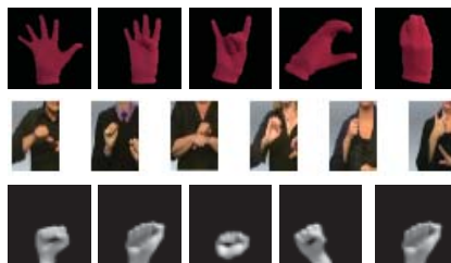
Fig. 1: Sample images from the LSA16 (first row), RWTH-PHOENIX-Weather (second row) and CIARP (third row) datasets.