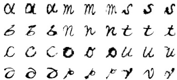
Fig. 3. Examples of characters extracted from the handwritten document images.