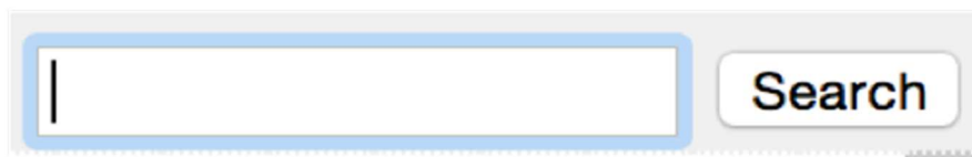
Figure 7: The PIE Lexicon search engine window

Automated customization of the dictionary to the users’ needs and characteristics is already provided in a preliminary form in the search function located in the control bar at the bottom of the site: