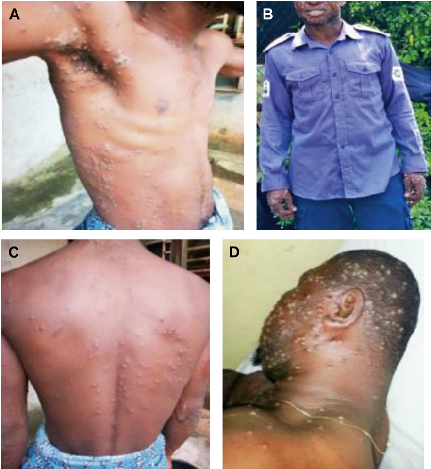
Fig. 3. (A–D) Papular-vesicular-pustular monkeypox skin lesions of varying sizes across the body.