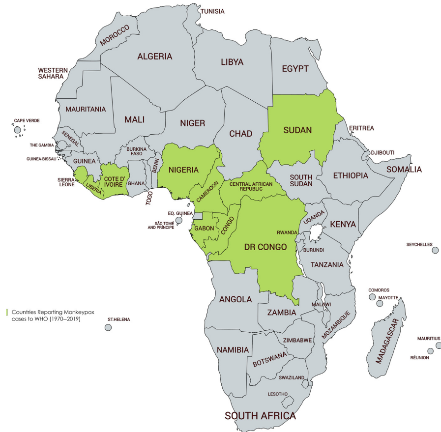
Fig. 1. Map of Africa showing countries reporting human Monkeypox cases (1971–2019).

cross-protection for humans against monkeypox, monkeys can be protected against monkeypox by immunization with the human smallpox vaccine. 18,19