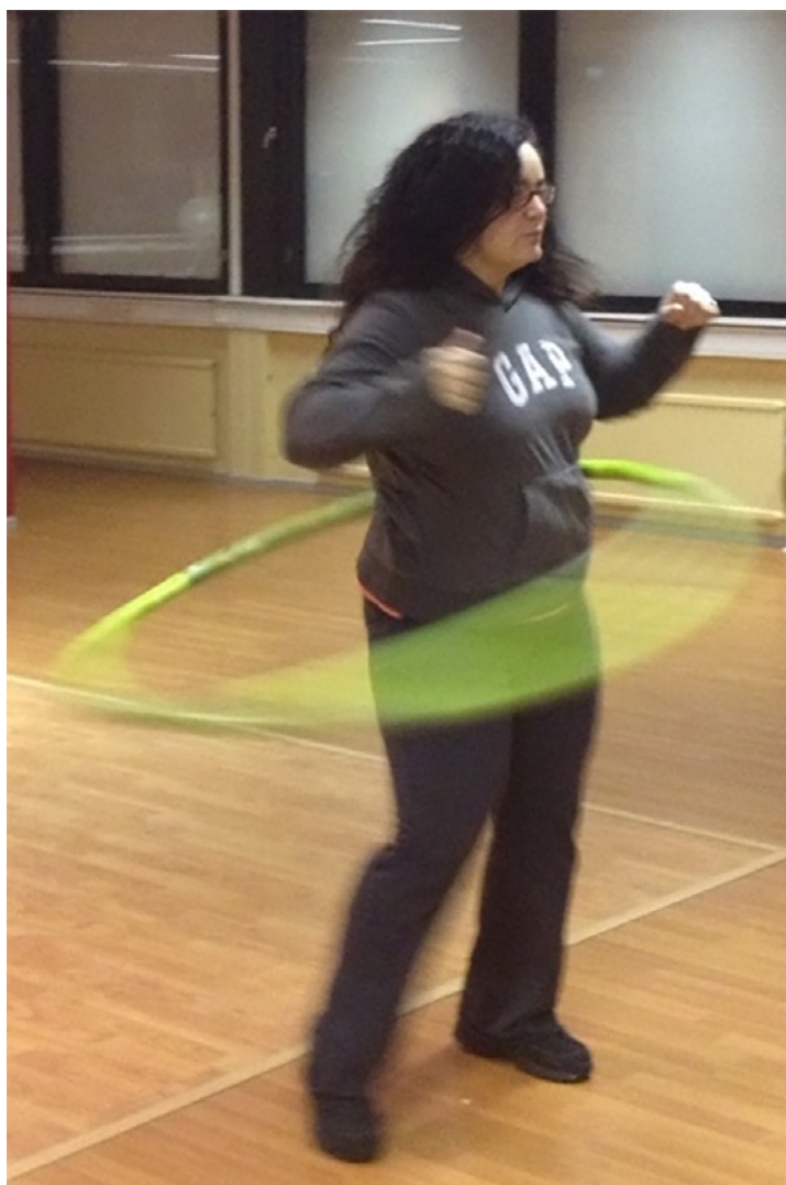
Fig. 2. A study subject hula-hooping using a 1.5-kg weighted hula-hoop (published with permission of the subject).

Cross-Over of Exercise Intervention. After visits 5 and 6, the study subjects crossed over to hula-hooping for those walking initially and vice versa. A hula-hooping training session was held for those commencing HULA after WALK.