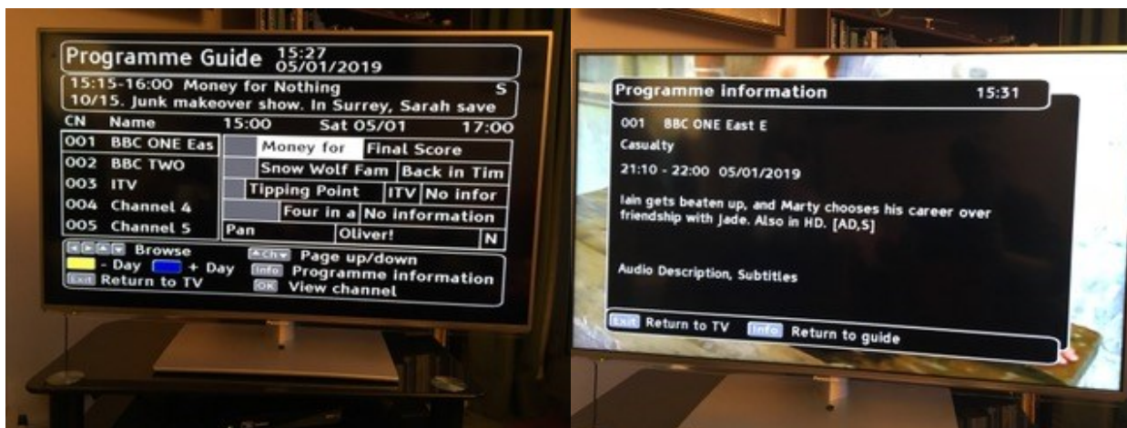
Figure 2. Electronic programme guide (EPG) layout from talking digibox, whole EPG on the left and a single programme information screen on the right. NB: colour layout.

The smart talking digibox gives different colour layout option everywhere as well as the accessibility options, that is if the programme has subtitles, sign language or audio description. If you are using the voice guidance on TV, there will be two sound sources, and with a hearing impairment it is difficult to decipher which is which, programme info or TV programme sounds, however, this might be usable for the visually impaired people who have normal hearing or a slight hearing impairment as the TV programme guide gives you date, timing, programme type and plot, and accessibility option, and in the further information table view it suppresses the TV voices. In the UK one can use so-called red button services to tune into a radio commentary for sport, such as a cricket commentary, as there is no audio description available for live sports as of now.