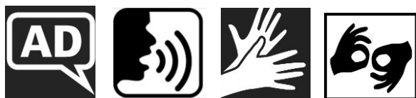
Figure 3. Examples of symbols for accessibility features. Two on the left are for audio description, the two on the right for sign language in the UK and Finland.

sues such as hills or valleys due to the broadcast infrastructure. Existence of these other channels, which are not within the research focus, may skew the results of this study in multiple ways. These are further discussed in the discussion section of the article.