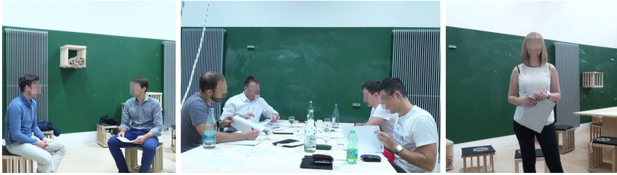
Fig. 2 Assessment-center setup (role play, group discussion, presentation). This figure is not included in the article's Creative Commons licence

achievement; influencing others , which reflects how successfully an individual can steer others either to adopt a certain point of view or to do or not do something; organizing and planning , which reflects individuals' ability to organize their work and resources systematically to accomplish tasks; and problem-solving , which reflects how individuals gather, understand, and analyze information to generate realizable options, ideas, and solutions (Arthur et al. 2003).