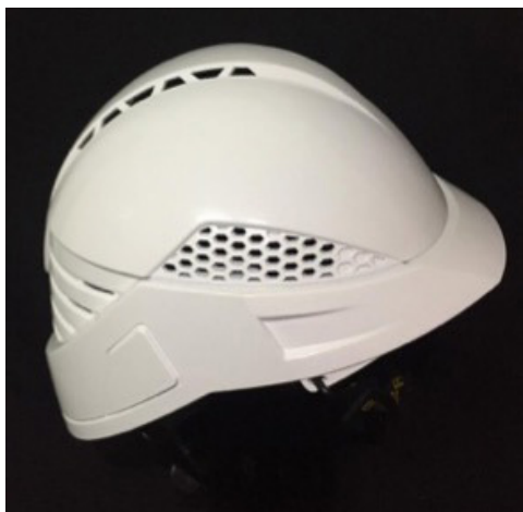
Figure 3: The new design for the prototype of safety helmet

Besides, harvesters are also attracted to the weight of the safety helmet C which was light compared to other prototypes. This can be associated based on the interview session where 83.3% of the complaints were about the weight of the existing safety helmet. The heavy materials that cause extra weight of the helmet contributes to discomfort (21). The minor reduction of weight, such as 45g in helmets weighing about 350g, the change weight was noticed by the wearers (10). The previous study also presented the workers complained about the deficient of existing helmet even though they are only wearing it for one month (9). Figure 3 below shows the new design for the prototype of safety helmet