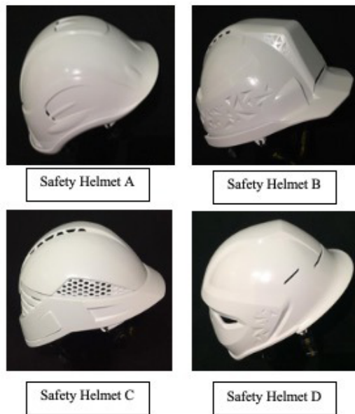
Figure 1: Different designs of prototypes safety helmets device

(Statistical Package of Social Science) SPSS Version 22.