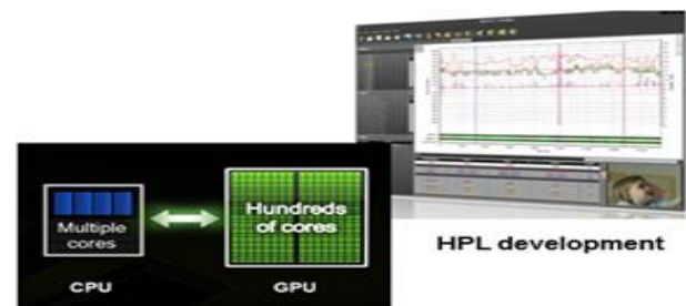
Fig. 8: The Visualization of HPC Software.

The visualization of HPC software is presented in Figure 8 below. The data training of EEG record are high potential to observe the future prediction of an eye blink and movement and the level of eye muscle stress.