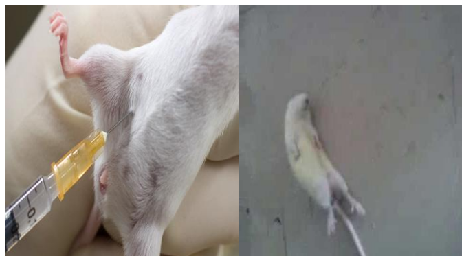
Fig. 2 Mice after seizure induced by sc-PTZ.

The PTZ (CD 97 ) test exploits a dose of pentylenetetrazole (85 mg/kg) to induce clonic convulsions that produces clonic seizures lasting for a period of at least five seconds in 95 % of the tested animals. Mice were divided into five groups (n = 6): the first group was pre-treated with normal saline (10 mL/kg); three groups of six mice each were given 300 mg/kg, 100 mg/kg, and 30 mg/kg body weight of the isolated compound, respectively; and the last group of six mice was pre-treated with sodium valproate (200 mg/kg) and served as positive control. After 30 minutes post-treatment, the convulsant was administered subcutaneously and the animals were individually monitored for the presence or absence of clonic spasm (of at least five seconds duration) to determine the compound ability to abolish the effect of pentylenetetrazole on seizures threshold [19]. The onset of twitching and myoclonic jerks were also recorded.