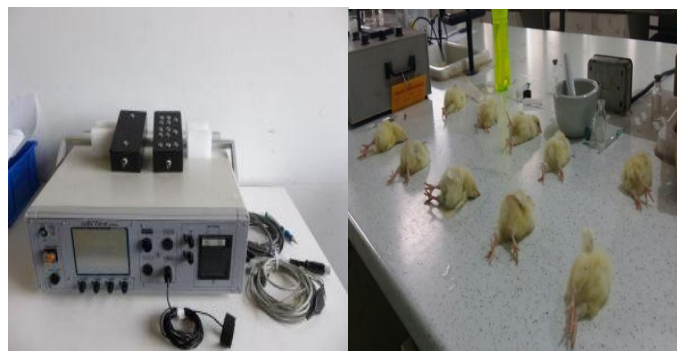
Fig. 1 Graphic picture of chicks after delivery of electroshock seizure.

placed on the upper eyelids of the chicks. A shock duration, frequency, and pulse width were set and kept at 0.8 s, 100 pulses/sec and 0.8 m/s respectively. A current of 75 mA which produced tonic seizures in 95 % of the control chicks was used throughout the study. Groups of chicks (n=10) were administered with normal saline (10 mL/kg), isolated compound (30, 100, and 300 mg/kg) and phenytoin (20 mg/kg) thirty minutes prior to the administration of shock. An incident of tonic extension of the hind limbs was regarded as full convulsion and the recovery time was recorded in unprotected animals, while lack of tonic extension of the hind limbs was regarded as protection.