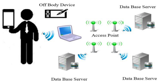
Fig. 2: Communication Modes Based on Infrastructure.