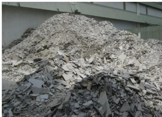
Figure 1: Ceramic waste abandoned in manufacturer

Ordinary Portland Cement (OPC) satisfying the requirement of ASTM C150-15 for cement Type I was used. OPC was obtained from local cement producer in Malaysia. The ceramic wastes were collected from a ceramic factory located in the south of Malaysia as shown in Figure 1. The ceramic waste utilized in the form of ceramic powder (as cement replacement) and fine ceramic aggregates (as fine aggregates replacement). The process for preparing the ceramic waste is similar to the previous research [13]. Normal quality Tap water (which was available in the laboratory) was used in experiments. Saturated surface dry (SSD) fine aggregates were used which had a specific gravity of 2.62 and fineness modulus of 2.85. Fine aggregates were modified according to ASTM C33-13. The well-graded aggregates usually reduce the demand for water and thereby, improve the packing density, robustness and workability of the mortar. Mix proportions of mortar are shown in Table 2.