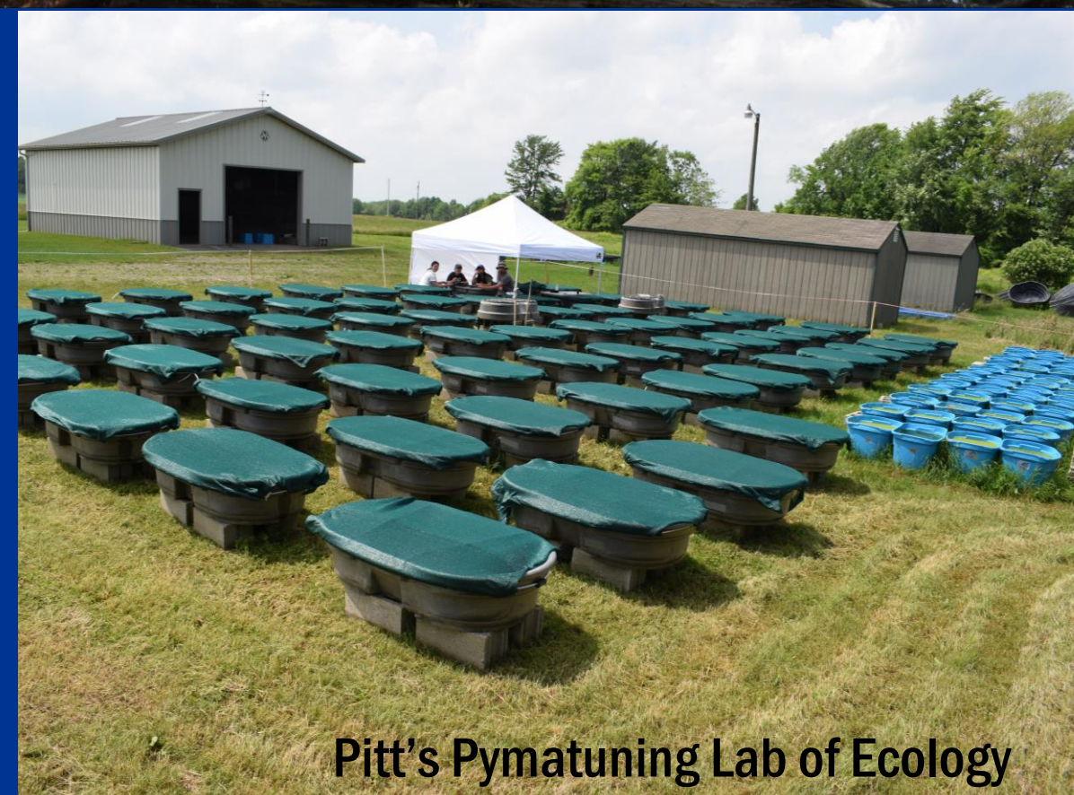
Pitt's Pymatuning Lab of Ecology