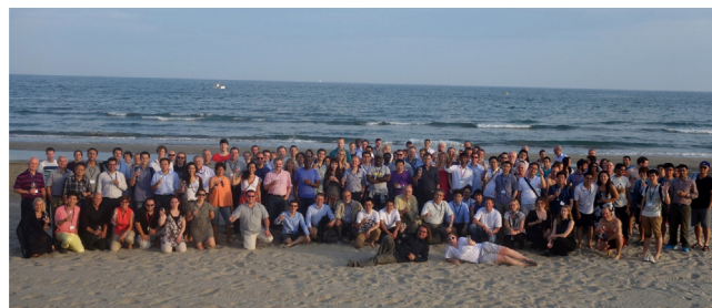
Symposium attendees at the beach Gala Dinner – June 11, 2015, La Grande Motte