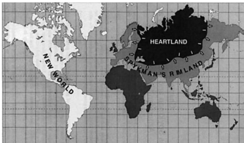
Figure 2. The concept of Rimland