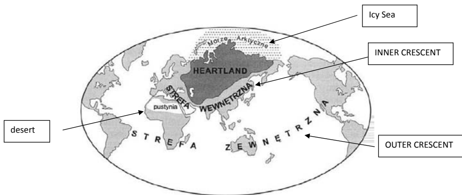
Figure 1. The Heartland concept

The first concept fundamental to geopolitics is Mackinder’s “Heartland doctrine”. It was formulated for the first time in 1904 with a telling title “ The geographical pivot of history ”. Mackinder draws the geopolitical model of the world in a very innovative way. Although geography is a stable factor, not susceptible to any modifications, he still manages to present a completely different way of