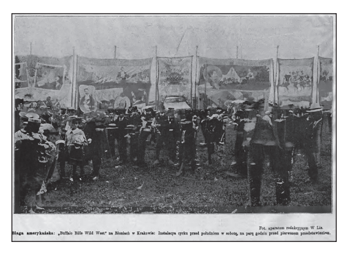
Figure 8. Buffalo Bill's Wild West at Meadows (Błonia) of Krakow: Installation of the circus on Saturday forenoon, a few hours before the first show; photo. W. Lis, Nowości Illustrowane , 1906 no 72.

Then other small groups of 'copper race' and 'black race' performers came, one by one. "The people, indignant at their ugliness, did yell at them some jokes, not always quite esthetic." In the meantime the show crew worked on putting up a huge tent around the arena on the great meadows in Krakow (Błonia) where the whole procession was heading. This was the kitchen for 800 people. The journalist says that Cody and his people reportedly consumed 800 kg of meat a day, eating meat three times a day. (Figs. 7–8)