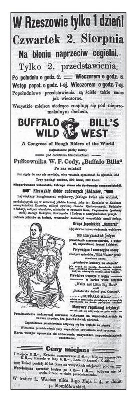
Figure 2. An Advertisement of Buffalo Bill's show in the local press from Lviv, Gazeta Lwowska, 1906 no 168 (July 25) Figure 10. An advertisement in the local press of Buffalo Bill's Congress of Rough Riders; World show in Rzeszów, Głos Rzeszowski, 1906 no 29 (August 5):4

that it was banal and boring.<sup>40</sup> In one article, the artists were named: "Indians from Judenstadt with rooster feathers in their hair and the paint partly fading from their faces."<sup>41</sup> The same newspaper in the following issue wrote that only "advertisement and organizations were perfect", and that the spectators watched "several dozen attenuated jades with savages on their backs".<sup>42</sup>