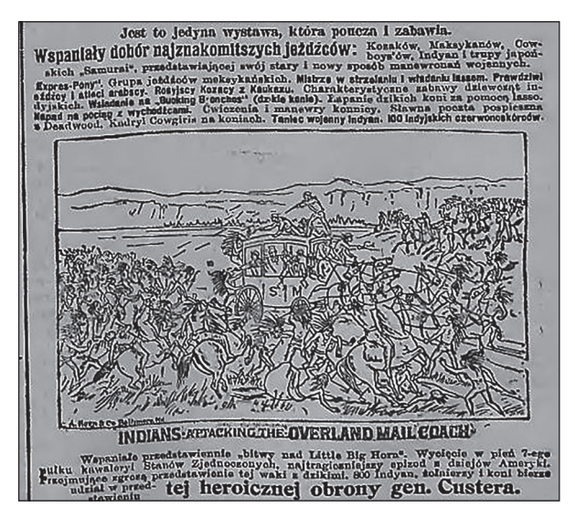
Figure 4. An advertisement in the local press of Buffalo Bill's Congress of Rough Riders of the World show in Rzeszów, Głos Narodu, 1906 no 348 (July 22):4 Figure 5. Fragment of an advert in the local press of Buffalo Bill's Congress of Rough Riders; World show in Cieszyn, Gwiazdka Cieszyńska, 1906 no 47 (July 28)

Kolomyia (July 23), Chernivtsi (July 24–25), Stanisławów (now Ivano-Frankivsk, July 26), Ternopil (July 27), Lviv (July 28–31), Przemyśl (August 1), Rzeszów (August 2), Tarnów (August 3), Krakow (August 4 and 5), Bielsko-Biała (August 6), Cieszyn (August 7), Ostrava (August 8), Opava (August 9), Přerov (August 10), Brno (August 11–12) and Jihlava (August 13). I will focus on the period of August 1–6 and discuss the shows played in Lviv (today's Ukraine) and the cities that currently belong to Poland. I will only occasionally refer to the press cover of the spectacles which took place in other cities.