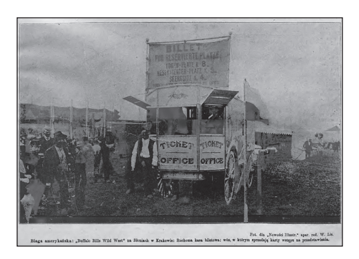
Figure 7. American sham Buffalo Bill's Wild West at Meadows (Błonia) of Krakow: moving ticket office: the wagon where they sell entry passes for the spectacle, photo W. Lis, Nowości Illustrowane , 1906 no 72.