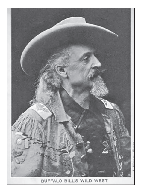
Figure 1. Buffalo Bill, photo taken in 1906, Vienna: J. Weiner, a postcard (National Library of Poland)

Often, the central message of the shows was the retreat of wild life in confrontation with the machine of Progress. Therefore, the Indians, even though they kept massacring Custer<sup>4</sup> and his soldiers in Buffalo Bill's shows, were presented and perceived as things of the past, their style of life, and their warlike nature, belonging to bygone days. They faked attacks and/or massacres of the settler's cabins or the Boy General's unit, but Buffalo Bill always arrived to save the victims in these spectacles. If not, it was always clear that the spectators were offered representations of things of the past. The Indians represented exoticism and violence and at the same time they were harmless (Kasson 2001:191-195). Thus, Native Americans continually "vanished" all over America in traveling tours of Buffalo Bill and other entertainers. They - the Pawnees, the Comanches, the Poncas, the Iroquois, and most of all the Sioux – did this also overseas, traveling with Wild West shows to Europe and other continents until the 1930s.