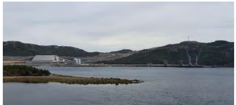
Figure 4: View of the Nickel Processing Plant at Long Harbour

Overall, it was hoped that the presence of the nickel processing facility at Long Harbour would attract services to the region that would, in turn, assist in attracting new residents.