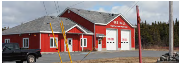
Figure 2: New Fire Hall in Long Harbour, March 2017

The level of traffic increased in the community during construction. Participants noted that the condition of the roads leading to Long Harbour was bad and presented a safety concern. Vale purchased and gifted the Town a new fire hall and fire truck. Key informants suggested that the Town was able to maximize some capital works projects, including a new water treatment plant and improved piping in the community. A new park was developed in cooperation with Vale and the Lodge and Training Centre (now Community Centre) was gifted to the town after the construction phase.