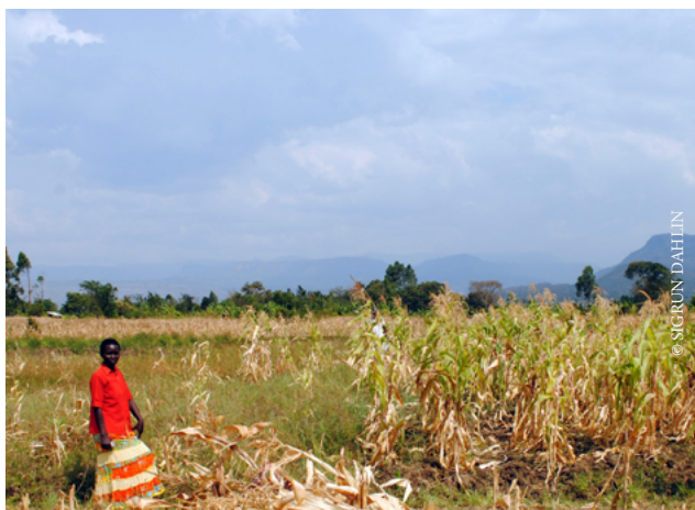
Delayed or poor weeding has a major impact on yield. Left part of this field was left un-weeded due to time constraints.

The large variation in labour productivity within each practice pointed to the effects of the subtle interactions between agroecology conditions such as weather events, management decisions and pest occurrence. The most suitable practices for a farmer will also strongly depend on the farmer's ability to invest, and on the relative scarcity of labour vs other limiting factors such as arable land and access to input and output markets.