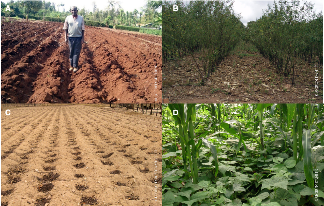
Figure 1. Some of the reviewed practices. A: The ridge alternative. B: No-till relay intercropping. C: Planting basins. D: Intercropping.