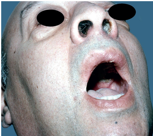
FIGURE 5: Ulceration of the soft palate