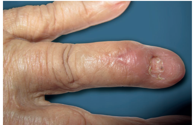
FIGURE 1: Cutaneous lesion of mucormycosis

finding is a necrotic eschar (Figures 3 and 4). 3,28 The patients can also have oral involvement with necrotic, black or white ulcers (Figure 5). Other signs are fever, periorbital cellulitis, periorbital edema, ophthalmoplegia, proptosis, loss of vision, and other neurological deficits. 29,30 The disease can be divided into three clinical stages: stage I, with signs and symptoms limited to the sino-nasal area; stage II, which is characterized by a sino-orbital infection; and stage III, which has intracranial involvement. 30